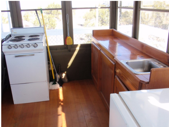
View of kitchen area electric stove, dry sink and refrigerator