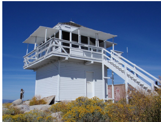
Black Mountain Lookout

This lookout has not been staffed since the 1980's and was turned into a recreation rental in 2011. It was constructed in 1934, and is a great example of Civilian Conservation Corps (CCC) architecture. The C-3-type lookout is situated on a single story 10 foot tower and is extremely well-preserved. Black Mountain offers striking views of Honey Lake to the north, and Last Chance Creek to the south. Frenchman Lake is within a 30-minute drive.