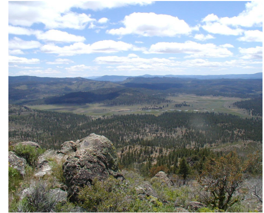
View of Last Chance Creek from lookout to the southwest