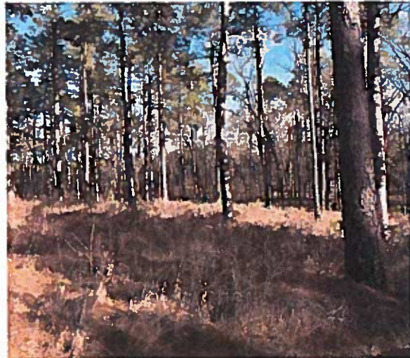
Desired Condition: Approximately 60 year old longleaf pine stand

I have reviewed the project and the preliminary environmental consequences associated with the proposal and find that this project meets the criteria for a Healthy Forest Restoration Act (HFRA) categorical exclusion (CE). Section 603 of the Agricultural Act of 2014 (commonly referred to as the Farm Bill) establishes a categorical exclusion for qualifying insect and disease projects in designated areas on National Forest System lands. An insect and disease project that may be categorically excluded under this authority is a project that is designed to reduce the risk or extent of, or increase the resilience to, insect or disease infestation in the areas (HFRA, Sections 602(d) and 603(a)).