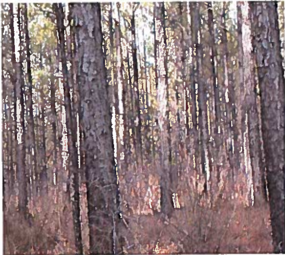
Current Condition: Approximately 60 year old loblolly pine stand in the project area.

The project area currently does not meet the desired future conditions as described in the Forest Plan for sub-management area 3BL and 5CL. There is a need to implement forest plan direction by working towards meeting the desired future conditions of the project area.