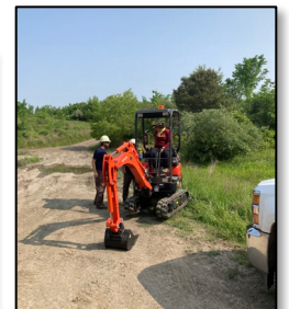
Equipment and care for the mule team (left) and a new mini-excavator (right) funded by recreation fees.