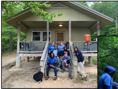
SCA crew members posing (above) after invasive plant treatment (right) at Hardin Ridge Recreation Area.

In the late summer of 2023, the Hoosier National Forest hosted the Student Conservation Association (SCA) for one week to assist in projects in the Hardin Ridge Recreation Area. This work included treating over one acre of invasive plants such as autumn olive, wineberry, and multiflora rose with herbicide and pruning. Recreation fees funded $5,000 worth of materials and labor for the project.