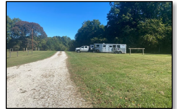
A freshly mowed campground on the Hoosier National Forest.

In 2023, the Hoosier National Forest spent $20,000 on mowing and cleaning contracts to maintain and improve quality public camping experiences at several developed sites including Shirley Creek, Springs Valley, and Youngs Creek Campgrounds and Trailheads. This included weekly mowing and cleaning by contractors throughout the summer. All the work performed is made possible by recreation fee program dollars.