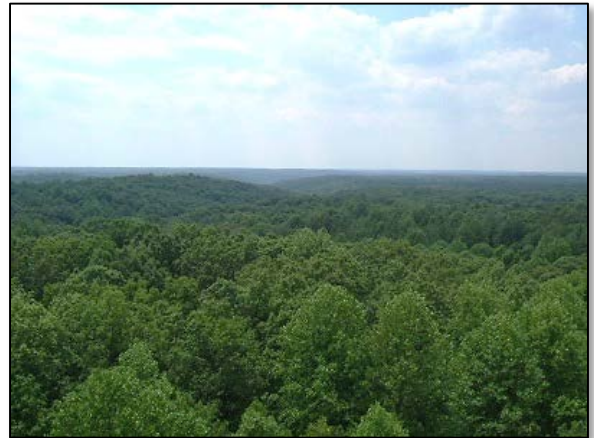
Treetop view from the Hickory Ridge Lookout Tower, which overlooks the Charles C. Deam Wilderness.