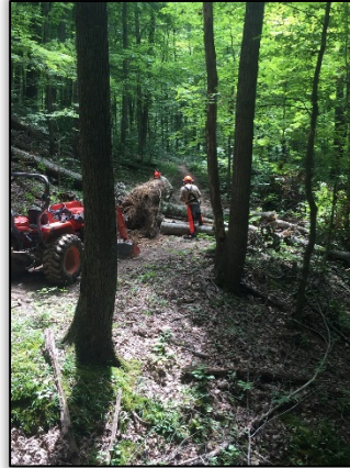
Volunteers clearing trees off trails

The forest offers visitors access to over 60 miles of motorized trails and 45 miles of horse trails. Annually, fees from trail permit sales, along with volunteers and partners, are leveraged to help keep these trails in good condition. In 2017, recreation fees were used to purchase a new kiosk at an ATV trailhead, trail maintenance supplies such as gravel and permeable pavers, and trail junction signs.