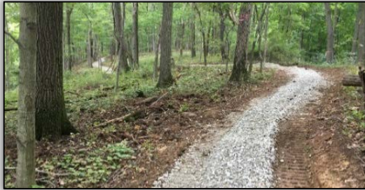
New trail construction on the Kinderhook Horse Trail

The forest constructed almost ten miles of horse trails horse trails in Washington and Monroe Counties. In Washington County, 4.4 miles of new trail were added to the Kinderhook Horse Trail system, resulting in two new loops that increase riding opportunities for visitors. The Washington County Chapter of the Ohio Horseman’s Council and volunteer assistance provided $5,000 in matching funds to purchase stone for the Kinderhook Horse Trail extension. In Monroe County, 5.3 miles of trail were constructed to create the new Plainview Horse Trail system, in partnership with the Monroe County Chapter of the Ohio Horseman’s Council and volunteers. Approximately $50,000 was leveraged with annual federal funds and partnership contributions for this project.