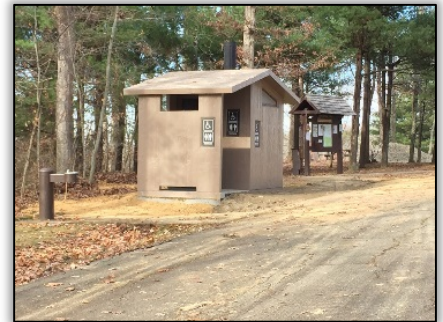
One of three new vault toilets installed at Burr Oak Cove Campground

The forest spent $90,000 in recreation fees to address health and safety issues at Burr Oak Cove Campground. The funds were used to replace three vault toilets and decommission one vault toilet at this campground. Through cost saving efforts, the Forest was also able to replace the vault toilet at Stone Church Horse Campground with the funds. This project helped reduce $88,722 of deferred maintenance at recreation sites in Athens and Perry Counties.