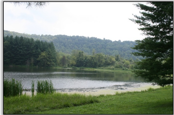
Overlooking pond at Lamping Homestead Campground

Leveraged trail grant funds along with partnership and volunteer contributions to reroute trails. The forest completed routine maintenance on 143 miles of motorized trails and 121 miles of non-motorized trails. Activities included the removing downed trees, repairing and/or installing water diversion structures and culverts, repairing eroded trail tread, installing signs and trail markers and providing security patrols.