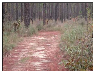
Little Tiger ATV trail