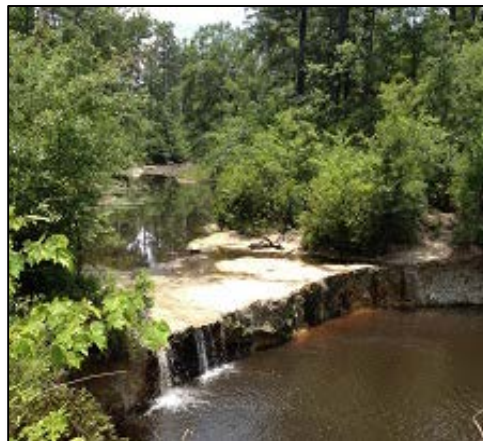
Potato Creek Waterfall