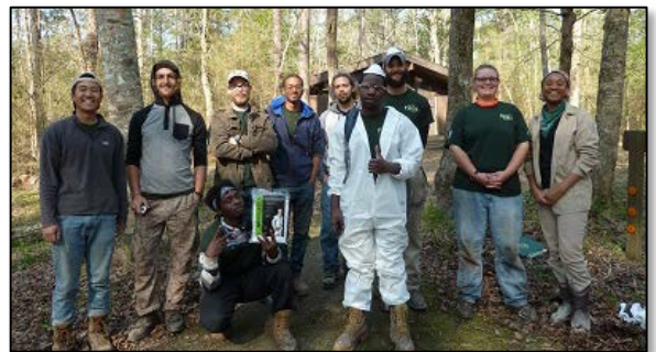
American Youth Works Crew from Texas Conservation Corps helped with repair of many recreation facilities on the forest including, boardwalk repair, bathhouse maintenance, sign installation, and recreation area trail maintenance.