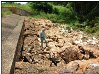
Ranger surveying damage to Ratcliff Lake Spillway. Erosion dropped the section he is standing on five feet.

The forest took major steps to repair Ratcliff Lake Spillway. Several major rainfall events in recent years have taken their toll on the 80 year old Civilian Conservation Corps reconstructed spillway. The very popular Ratcliff Lake Recreation Area, which surrounds the lake, is dependent on the lake and, had the spillway failed, could have put the public and a state highway in jeopardy. Recreation fee funds of $88,000 and several other funding sources paid for spillway replacement drawings and construction. Completion of the project is scheduled for 2018.