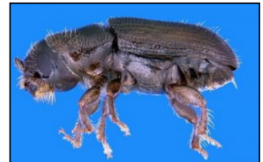
Adult southern pine beetle.

National Forest Location: Winston, Lawrence and Franklin Counties Congressional Districts: Congressman Robert Aderholt (R- District 4) – Bankhead NF Approximate Number of Ground Checked SPB Spots (Areas): 24 spots SPB Spot (Area) Latest Flight Detection (AFC and FS): 47 spots SPB Treated Acres: Approximately 546 acres within timber sales and 0 outside of the sale boundary Estimated Percentage of Acres Impacted: 3 percent of District acres Estimated Wilderness Acres Impacted: 0 Technology Used: Juno B's and Collectable Tables Response Phase: Location of SPB spots, sale preparation and timber harvesting