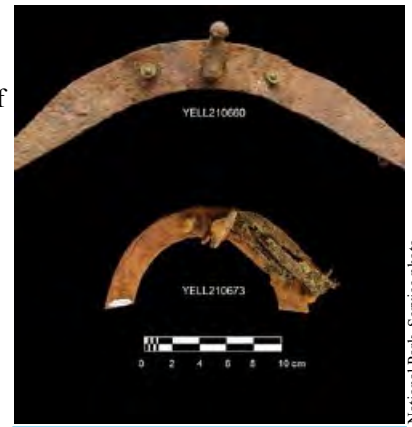
McClellan saddle cante arc and plate from a McClellan saddle, recovered from the Nez Perce Mountain Bivouac Site (48YE506).

Culturally modified trees are trees possessing physical alterations that reflect human utilization of forested ecosystems, and many were observed within the forests near the site. These include both axe-cut (pole size) stumps and a number that had been stripped of large sheets of bark, probably for cambium recovery. The presence of 1870s-period military and non-military artifacts at the site further corroborates the tree-ring analysis, indicating the site likely functioned as a Nez Perce bivouac during the 1877 Flight.