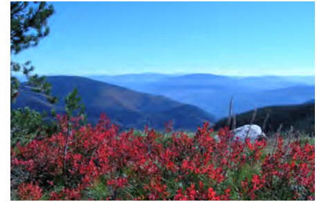
NPNHT Central Idaho Sandra Broncheau-McFarland, U.S. Forest Service photo