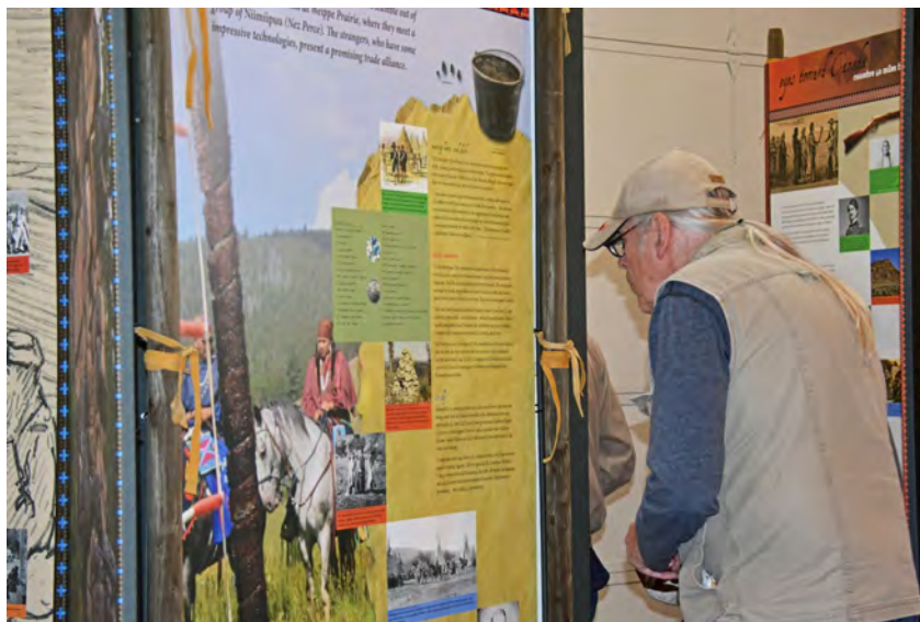
Visitors to Travelers' Rest State Park enjoying the traveling exhibit, The Journey of the Resilient Niimiipuu Nez Perce People .