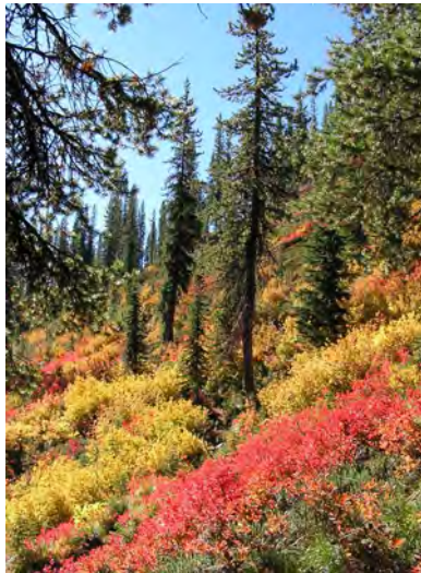
NPNHT Central Idaho