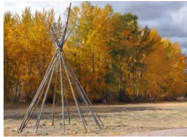
Travelers' Rest State Park, MT