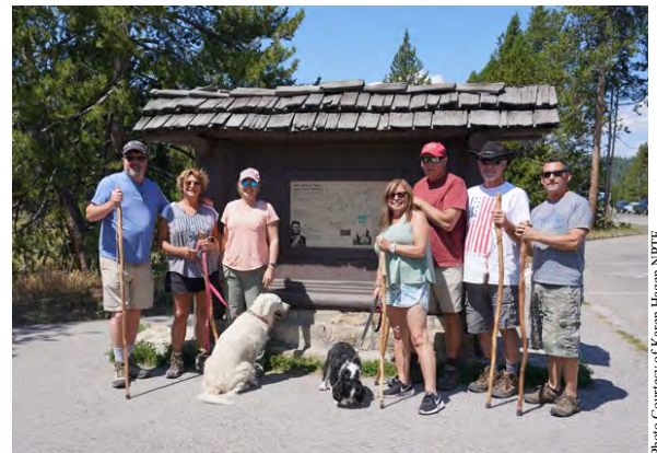
Summer Education Tour group at YNP NPNHT Interpretive sign near Nez Perce Creek.

Our tour then departed Yellowstone National Park via Cooke City, MT, and the Chief Joseph Scenic Highway and the Crandall Creek exit route area. We explored Sunlight Creek and the valley to identify several exit routes of the Nez Perce. The group visited Dead Indian Gorge, Dead Indian Hill, Paint Creek, and Clarks Fork of the Yellowstone Canyon Gateway. We stopped at the interpretive kiosk at the summit and the NPTF metal sculpture which was in good condition ( photo left )