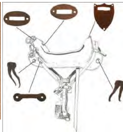
Artifacts identified as part of a pre-1874 McClellan pattern saddle. Clockwise: cante plates, pommel ornament, front ring staple, foot staple, and rear ring staple.