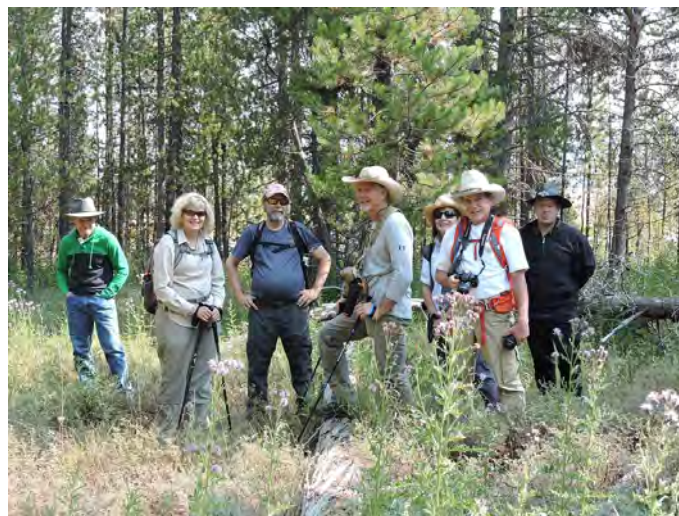
Yellowstone Meetup group at Cowan campsite