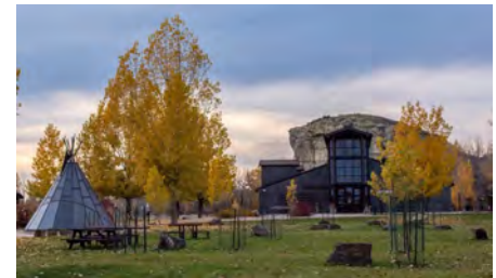
Pompeys Pillar, near Billings, MT