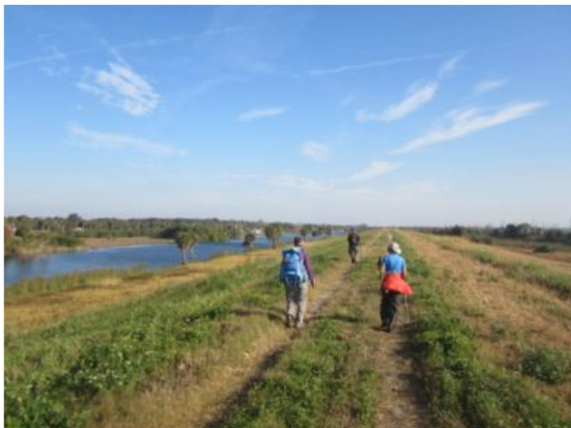
Lake Okeechobee – Western side

Tread: Wide and relatively smooth, with few irregularities.