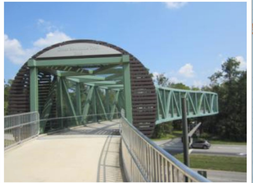
Cross Seminole Trail