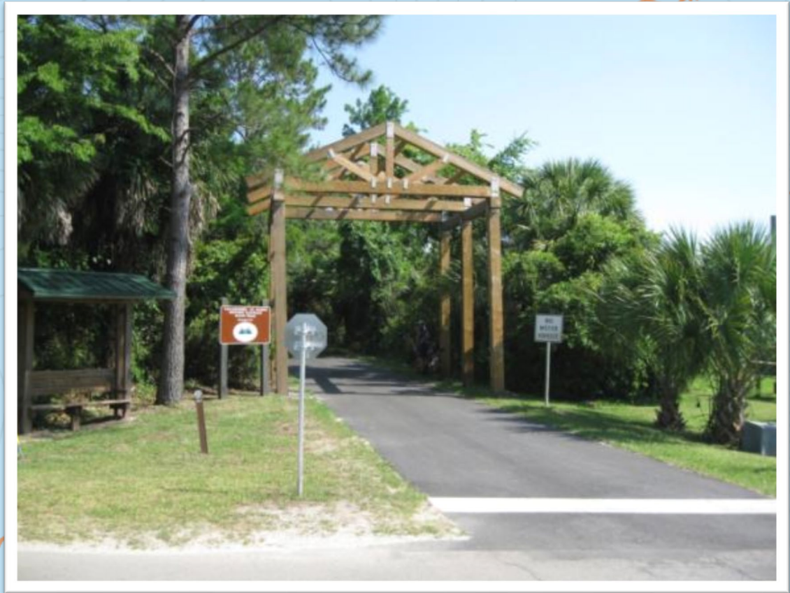
St Marks Rail-Trail

Typical Rec Experience: Requires little to no self sufficiency. Users can expect a high level of infrastructure and multiple uses.