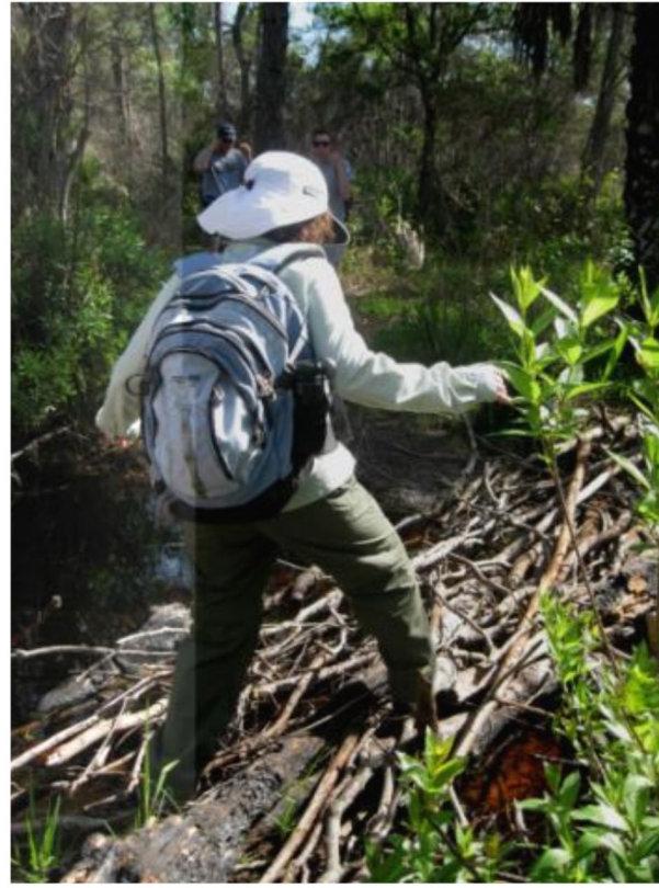
Juniper Wilderness, Ocala NF

Constructed Features: Minimal to non-existent