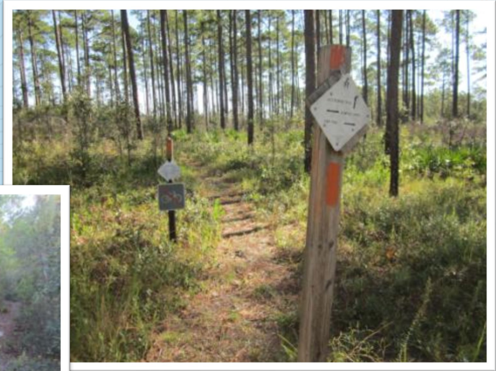
Pine Log SF