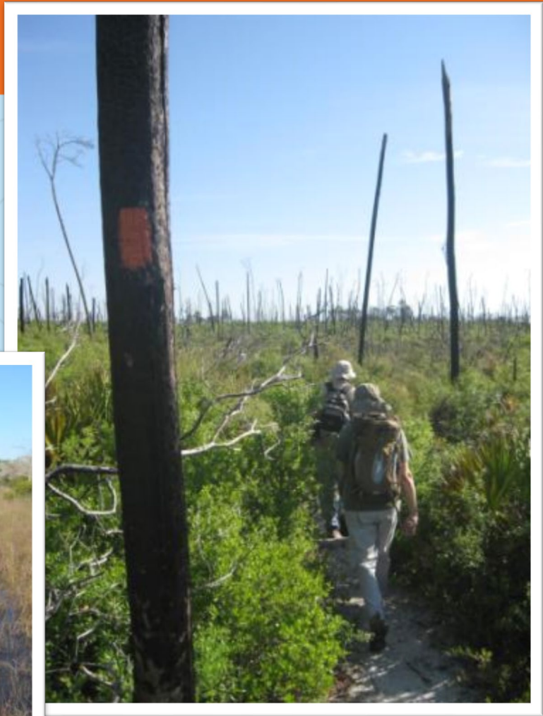
Juniper Wilderness, Ocala NF