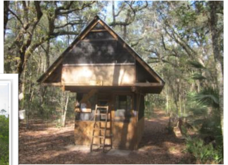
Rice Creek Conservation Area