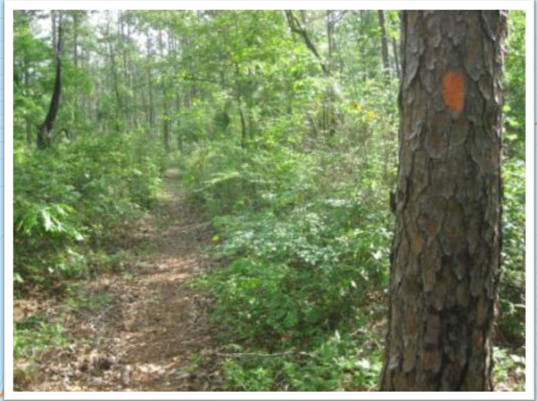
Jackson Trail, Blackwater SF

Trail Classes are general categories reflecting development scale, arranged along a continuum with no hard and fast lines drawn between the classes.