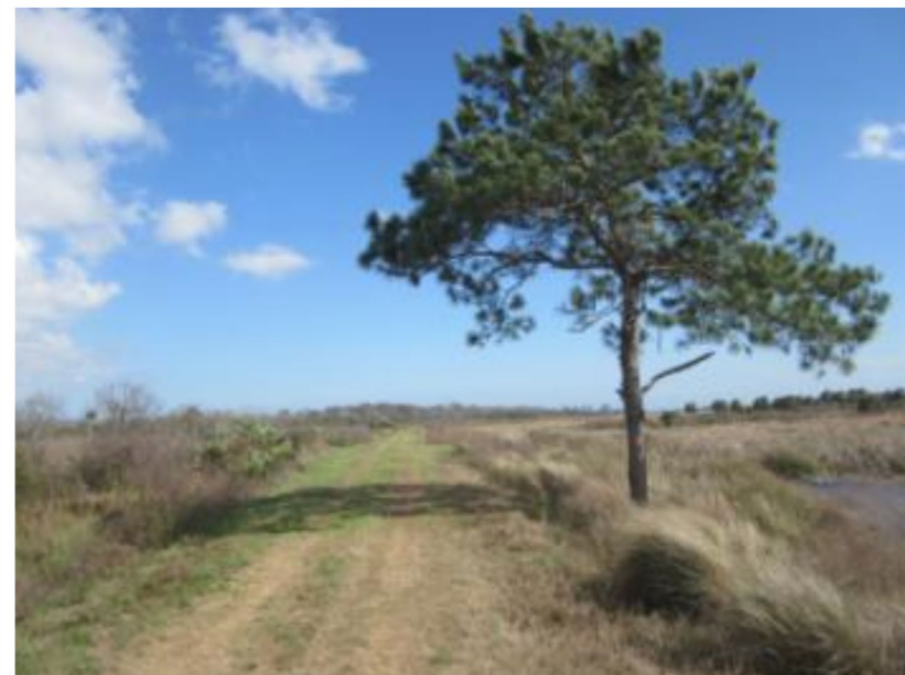
St Marks Wildlife Refuge