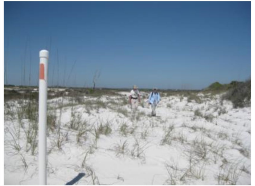
Santa Rosa Dunes