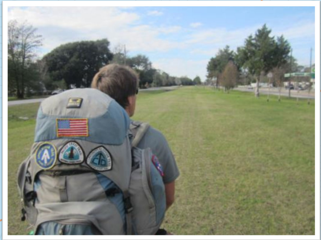
Palatka Lake Butler Rail Trail

Typical Rec Experience: Similar to Class 3 but with more developed infrastructure and access to services.