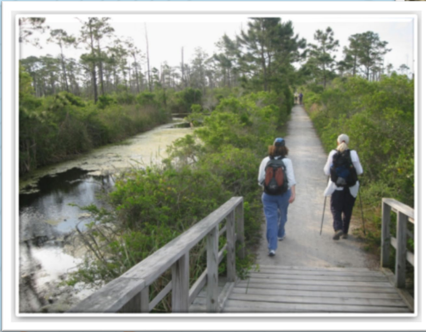
Gulf Island National Seashore

Constructed Features: Frequent and substantial. Trailside amenities may be present.