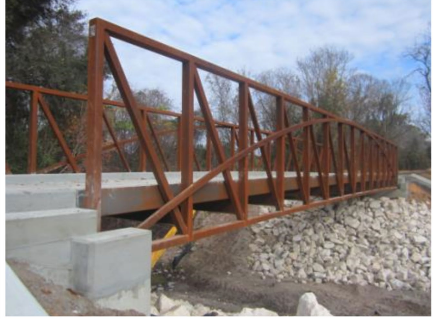
Palatka Lake Butler Rail Trail