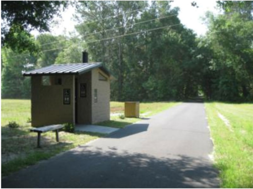
St Marks Rail Trail

Constructed Features: Frequent or continuous; may include bridges, boardwalks, curbs, handrails, trailside amenities, and similar features.