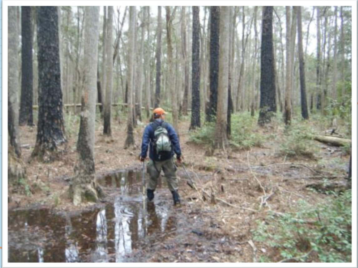
Bradwell Bay, Apalachicola NF

Experience: Requires advanced planning and a great degree of self sufficiency.