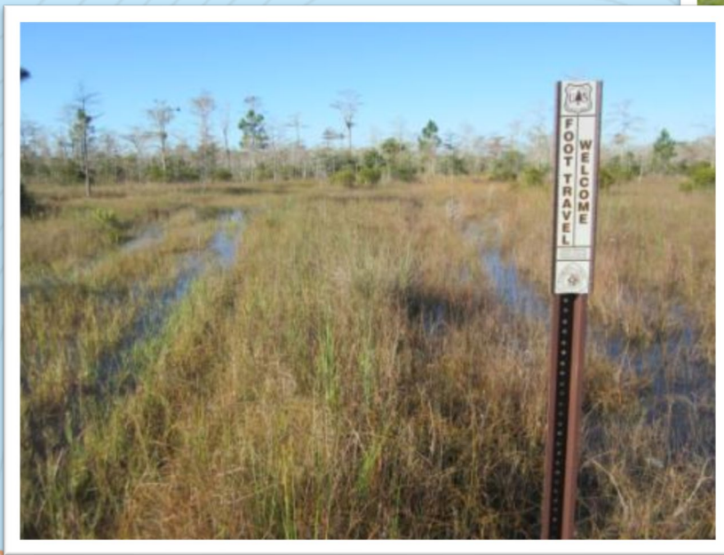
Big Cypress Preserve

Signs: Route identification signing limited to junctions. Route markers present when trail location is not evident.