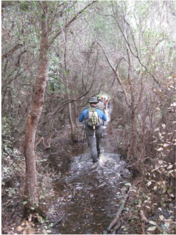
Bradwell Bay, Apalachicola NF