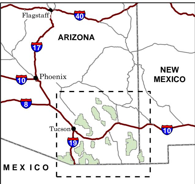
Exhibit A Restricted Areas within the Coronado National Forest Order Number 03-05-00-21-020