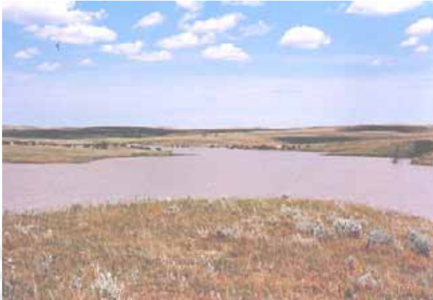
Figure 4: Stock pond on the Grand River National Grassland.

We are reporting economic effects of three resource programs: livestock grazing, oil and gas production, and recreation. These three are the most quantifiable programs with regard to economics on the Dakota Prairie Grasslands.