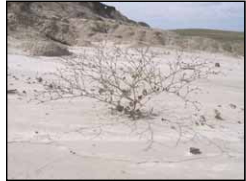
Figure 2: Dakota buckwheat, Grand River National Grassland, summer 2005.