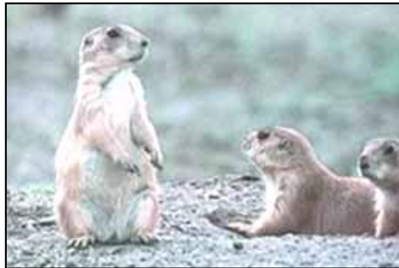
Figure 8. Black-tailed prairie dog.

We remapped all prairie dog colonies on the Dakota Prairie Grasslands in 2005. The results of this survey are shown in Table 5, and are compared to results from earlier periods. These data show that prairie dog acreage, and thus the amount of suitable habitat, has increased in recent years. These increases are making progress toward the Grassland Plan's objective to establish a series of black-tailed prairie dog colony complexes across the Grand River and Little Missouri National Grasslands.