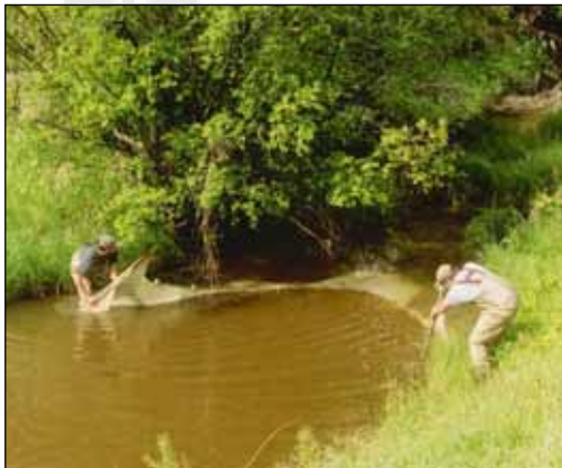
Figure 3: University of Idaho researchers seining fish on the Little Missouri National Grassland, summer 2005