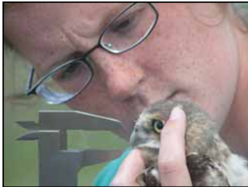
Figure 9. St. Cloud State University researcher measuring bill length of juvenile burrowing owl. Little Missouri National Grassland. Summer 2005.

As also noted above, researchers from St. Cloud State University have been monitoring the Dakota Prairie Grasslands' burrowing owl population for several years. Total population density varies year-by-year, but is consistently low (about 1 pair per 72-125 acres of occupied prairie dog colony). Productivity rates appear adequate to at least maintain a viable population. The