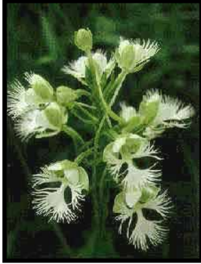
Figure 11: Close-up of the western prairie fringed orchid.

On the Dakota Prairie Grasslands, threatened and endangered species include gray wolf, whooping crane, bald eagle, black-footed ferret, and western prairie fringed orchid. National recovery plans exist for all of these species. The Dakota Prairie Grasslands does not support breeding populations of black-footed ferret, gray wolf, whooping cranes, or bald eagles, nor does the Grasslands currently contain important habitat for these species' recovery. The Dakota Prairie Grasslands is vitally important, however, to the recovery of the western prairie fringed orchid.