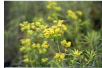
Figure 6: Leafy Spurge.

In 2004, the Dakota Prairie Grasslands provided over $300,000 of grant money to county weed boards, some grazing associations, and the North Dakota Department of Agriculture as part of a larger effort to help control noxious weeds on state and private lands within the administrative boundaries of the Dakota Prairie Grasslands. Fiscal Year 2005 data is currently unavailable, and will be included in the FY 2006 report.