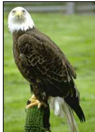
Figure 10. Bald eagle.

The Dakota Prairie Grasslands does not contain critical habitat for bald eagles. The species does not nest anywhere on the DPG, though a pair did nest near National Forest System land within the Grand River National Grassland in summer 2005. No winter roost site (as defined as a site with 5 or more regularly roosting eagles) occurs on the Dakota Prairie Grasslands. Bald eagles do regularly use the Dakota Prairie Grasslands during migration, and a few typically winter in widely scattered locales. Based on these facts, the Dakota Prairie Grasslands have very little potential to affect bald eagle recovery or viability.