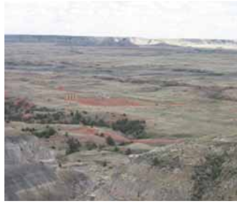
Figure 5: Oil well pad on the Little Missouri National Grassland in the Tracy Mountain field.

Oil and gas production numbers for the Dakota Prairie Grasslands are kept in collaboration with the Bureau of Land Management (BLM). The BLM keeps the “down hole” records and manages below surface resources. This data is stored with the Minerals Management Service. Due to an on-going lawsuit, and changes in accounting and computer systems, agency specific information for 2005 has not yet become available. The numbers used for the table below are from 2002.