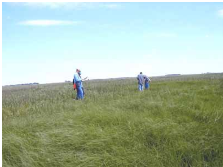
Figure 15. Surveying for western prairie fringed orchid. Sheyenne National Grassland. Summer 2005.