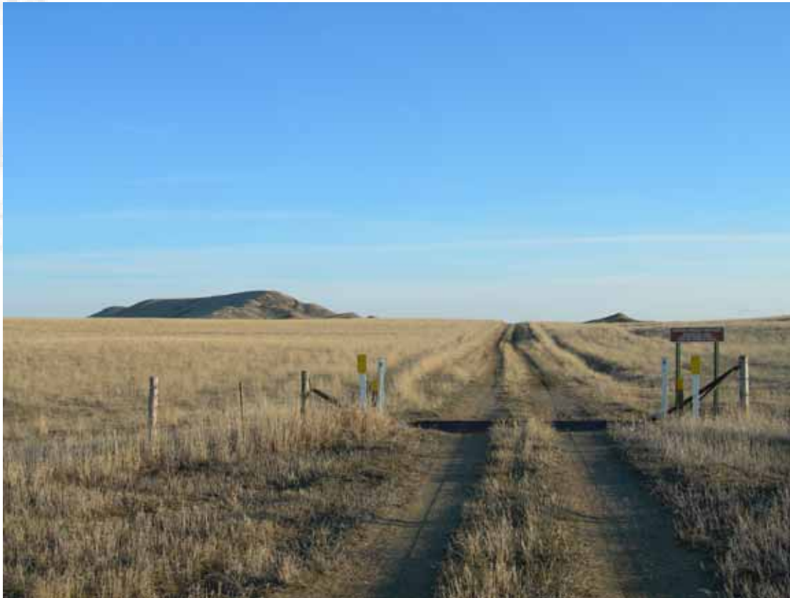
Figure 16. North entrance to Pasture 5a on the Grand River National Grassland. White Butte in the distance.