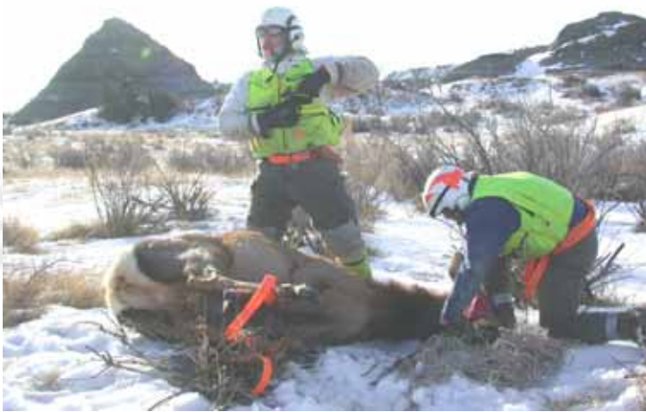
Figure 14. National Park Service employees preparing an elk for radio collaring in winter 2005 as part of a multi-agency project to assess elk response to land management activities, including oil and gas development.

In 2005, we also cooperated on the multi-agency monitoring of elk movements in and out of South Unit Theodore Roosevelt National Park. This effort, led by the US National Park Service and US Geological Survey, began in 2004 and is expected to continue through 2008. One important aspect of this research is determining elk response to oil and gas development.