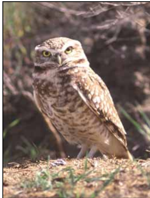
Figure 7. Burrowing owl.

Black-tailed prairie dog populations (and habitat) were measured on the Little Missouri National Grassland in 1997, 2002, and 2005 (see Table 5). Burrowing owl populations have been systematically surveyed on the Little Missouri National Grassland since 1998. Black-tailed prairie dog populations have increased substantially (~60%) in recent years (Table 5). Owl populations have also recently increased, albeit to a more modest extent. For example, in 1998, 14 of the 62 prairie dog colonies surveyed were occupied by burrowing owls, whereas in 2002, 17 of the 65 colonies surveyed were occupied. In 2004, 20 of the 71 prairie dog colonies surveyed were occupied by burrowing owls (Marco Restani, researcher, pers. comm.). At least a portion of this increase, however, is likely due to the more intensive searching done in 2004 (Marco Restani, researcher, pers. comm.).