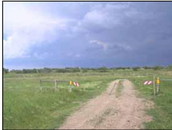
Figure 1: Sheyenne National Grassland. Summer 2005.

The Grand River Ranger District administers the Grand River and Cedar River National Grasslands.