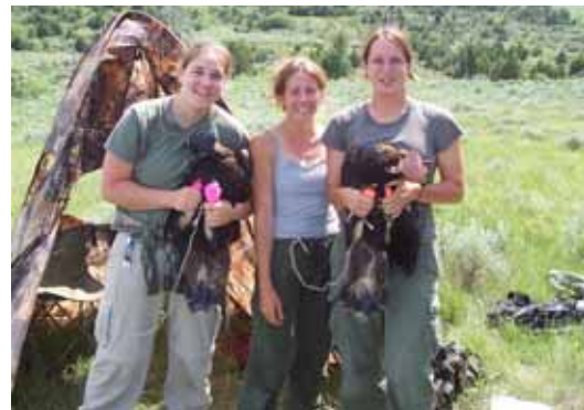
Figure 13: University of North Dakota researchers preparing golden eagles for banding, summer 2005.

During LRMP development, concern was expressed over both the need for oil and gas stipulations and the effectiveness of those stipulations. Of particular concern were the measures intended to protect nesting raptors. To assess stipulation effectiveness, the Dakota Prairie Grasslands enlisted the cooperation of the University of North Dakota to study golden eagle nesting ecology on the Little Missouri National Grassland. This multi-year investigation began in 2001, and is currently being supported by a variety of agencies, including North Dakota Game and Fish Department. Field work will be completed in