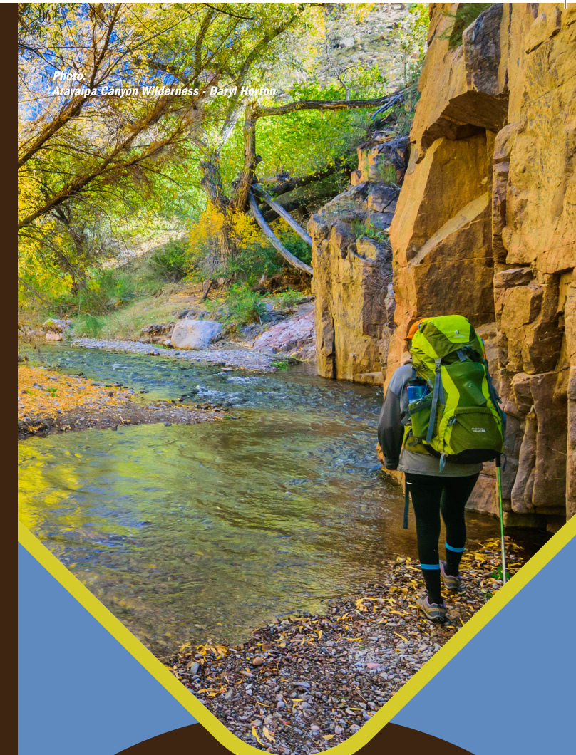
Aravaipa Canyon Wilderness

A. Refunds are not issued. Pass order confirmation letters, credit card receipts, and hangtags without Passes are also not accepted.