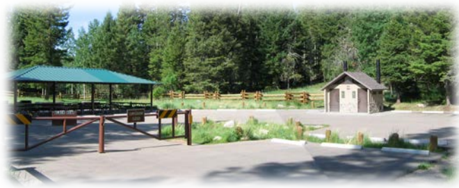
Figure 1: Black Bear Group Campground

All campgrounds are accessible via US and/or State highways along with paved Forest Service Roads. For details of access to each unit please refer to the map on page 2 of this guide.