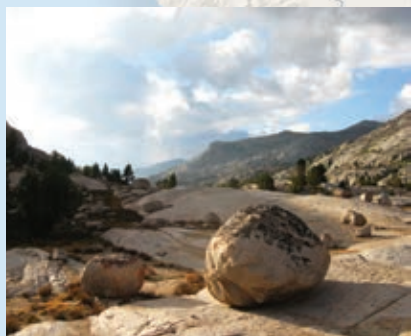
John Muir Wilderness