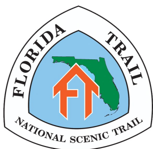
THE UNIFORM FNST