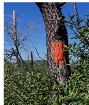
THE FNST BLAZE