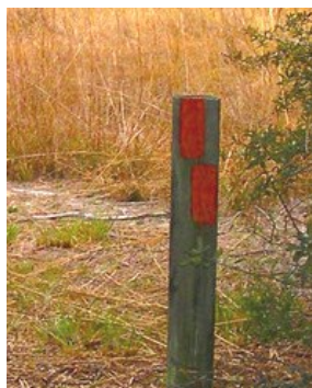
FNST DOUBLE BLAZE