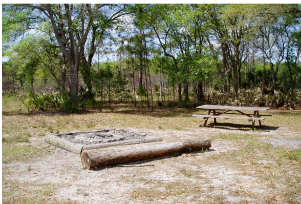
CAMPSITE AT SEMINOLE RANCH