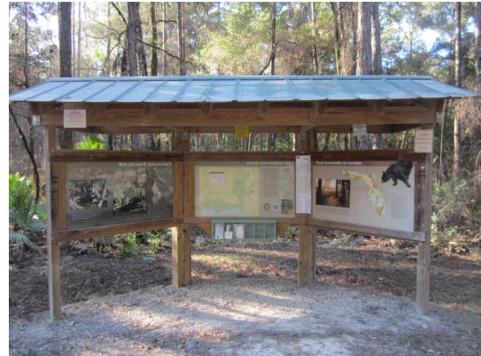
TRAILHEAD AT AUGILLA WMA