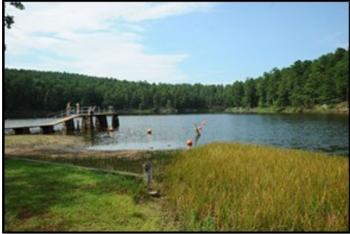
On a hot July day, there is no place better in Perry County, Arkansas to cool off than Lake Sylvia.