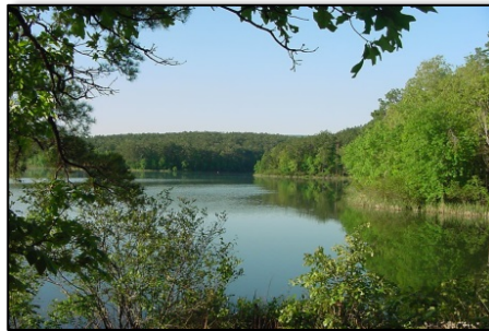
Beautiful Cedar Lake