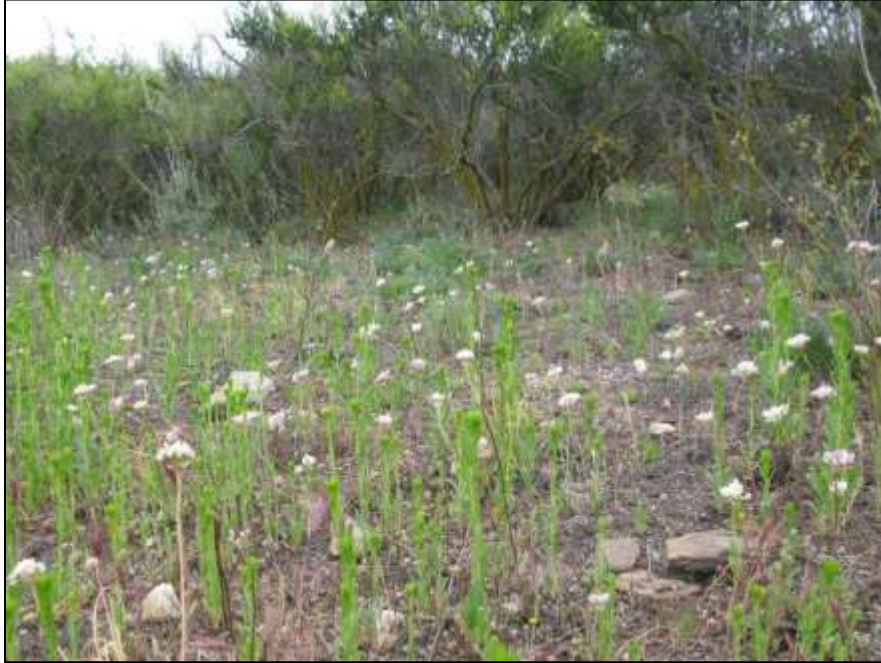
Figure 2. Allium munzii - May 8, 2013 field visit, Elsinore Peak.