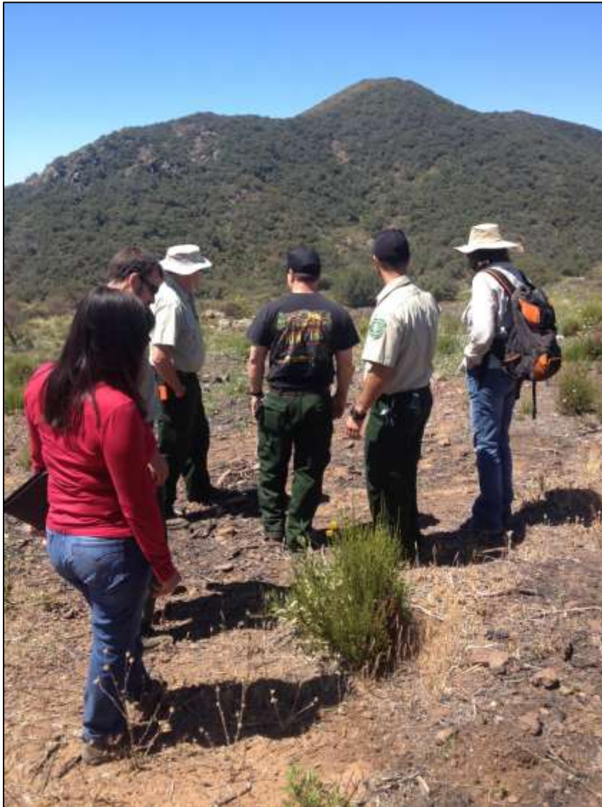
Figure 10. The monitoring team evaluates the results of a prescribed fire along North Main Divide Road.