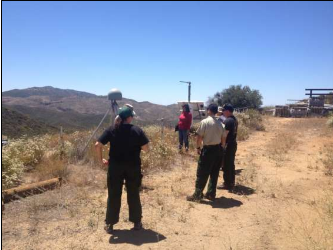
Figure 9. The monitoring team discusses the seismic monitoring installation near El Cariso Village.

A new permit should be issued, and monitoring should continue.