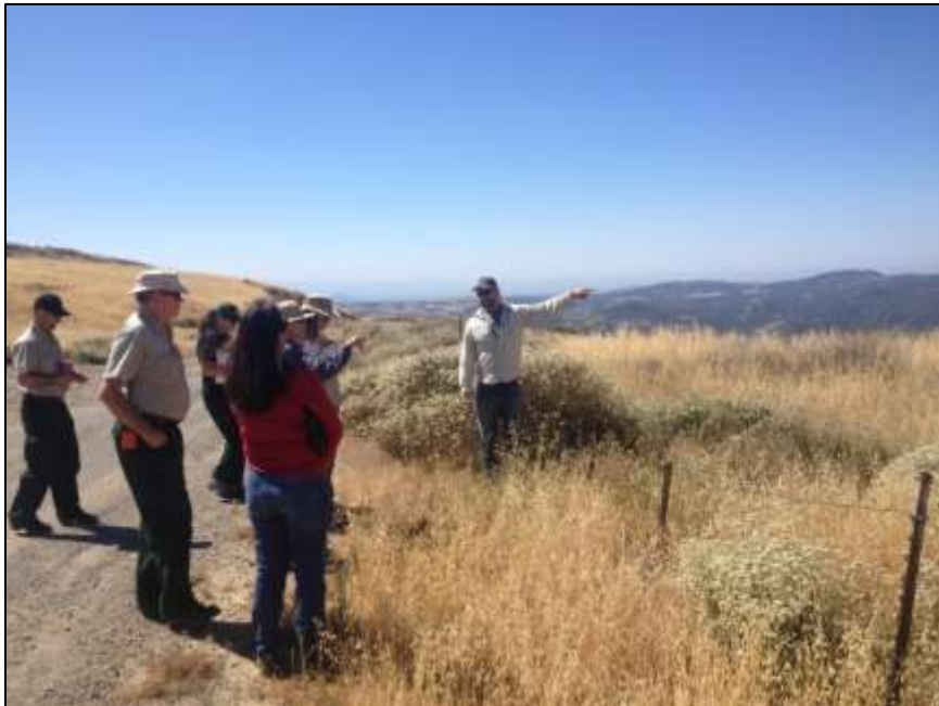
Figure 4. The Forest Rangeland Management Specialist discusses yellow starthistle control with the monitoring team.

Continue to monitor the site for new infestations and retreat as necessary. Improve communication through a meeting among Back to Natives, the Trabuco Ranger District Volunteer Coordinator, and the Forest Invasive Weed Specialist to discuss re-prioritization of eradication efforts and assess training needs. In developing a new agreement, include a work plan with agreed-upon priorities.