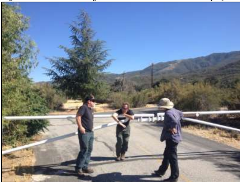
Figure 7. The monitoring team discusses the closed loop of the Oak Grove Campground.

Continue to monitor the condition of Oak Grove Campground and decide the long-term fate of its closed loop.