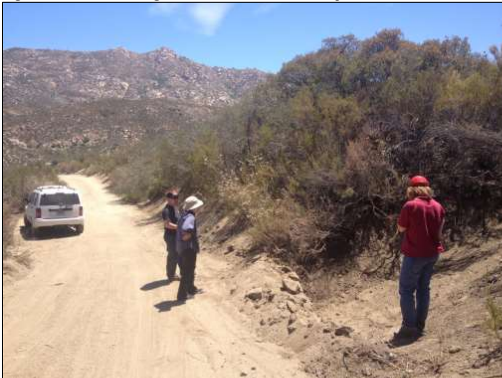
Figure 5. The monitoring team evaluates a culvert replacement on Corte Madera Road.

Finally, stormproofing would help to prevent soil erosion and water quality impacts along the entire length of Corte Madera Road. Improvements could include increasing the frequency of rolling dips, dealing with drainage issues at their origin, and addressing gully formation.