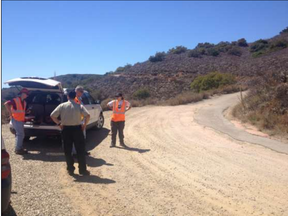
Figure 8. The monitoring team surveys the degraded condition of Long Canyon Road.

The project exists in the Elsinore Place of the Trabuco Ranger District and consists of an equipment installation for monitoring seismic activity.