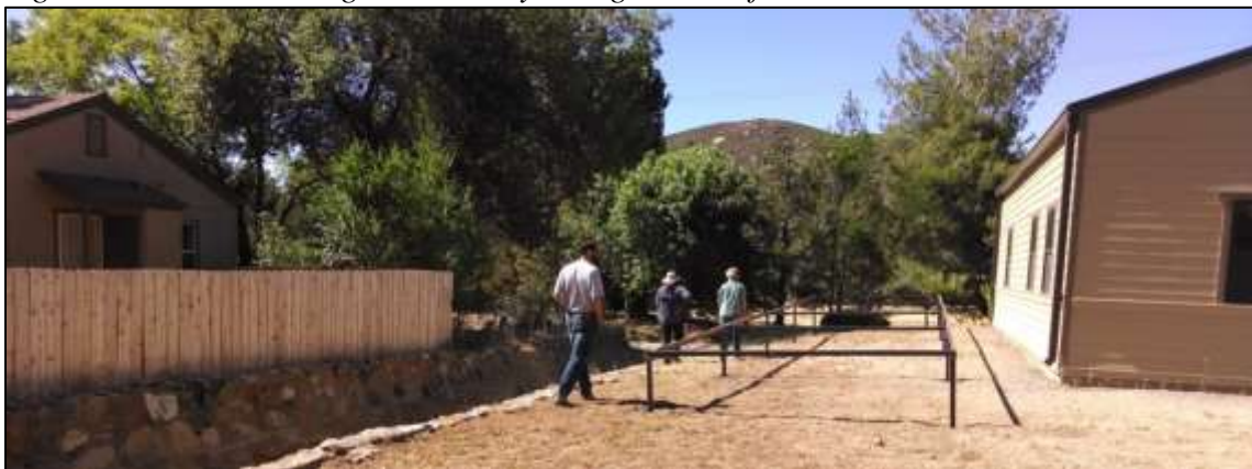
Figure 6. The monitoring team surveys the grounds of the Descanso Fire Station.

Continue to maintain and monitor the condition of the facility.