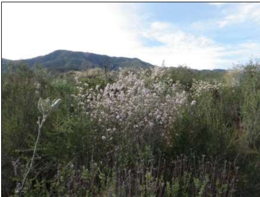
Figure 3. Ceanothus ophiochilus - March 15, 2013 field visit, Woodchuck Road.

Vail Lake Ceanothus: Kirsten Winter, Forest Biologist, and Betty Grizzle, USFWS biologist, visited the Woodchuck Road population as part of the background work for the 5-year review for this species. The population and its habitat looked good, and the number of individuals appeared to be equal to or greater than that present prior to the year 2000 Pechanga fire which reburned part of the population.