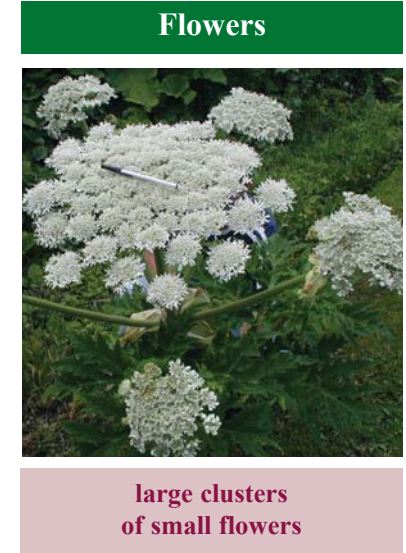
large clusters of small flowers