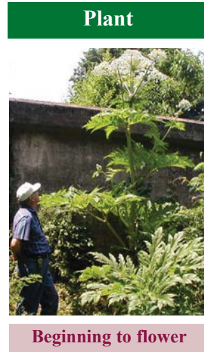
Beginning to flower

Branch County Calhoun County Gogebic County Ingham County Jackson County Kalamazoo County Kent County Manistee County Oakland County Ottawa County Saginaw County