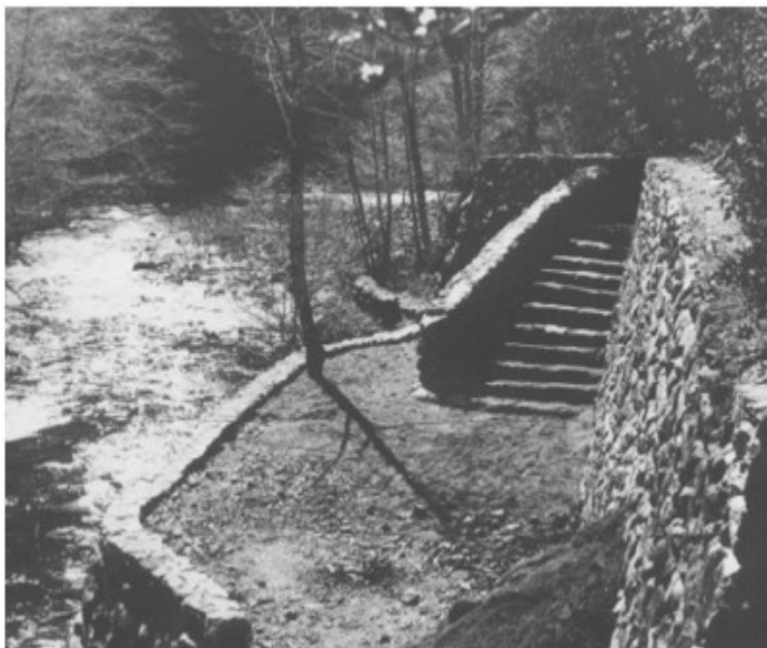
Photo from the 1930's of Patrick Creek rock wall built by the CCC.

Patrick Creek Campground has a special charm, with its steps, rock walls, restrooms, and sunken campfire circle built in the 1930s by the Civilian Conservation Corps. It's located 7.5 miles east of the Smith River NRA Visitor Center at mile post 22.0 on Highway 199. Patrick Creek Lodge is directly across the highway. Adjacent to the camp-ground is Patrick Creek Picnic Area, a no fee, day-use area with good river access. A paved, accessible 0.2-mile trail leads to a fishing platform at the confluence of Patrick Creek and the Middle Fork of Smith River.