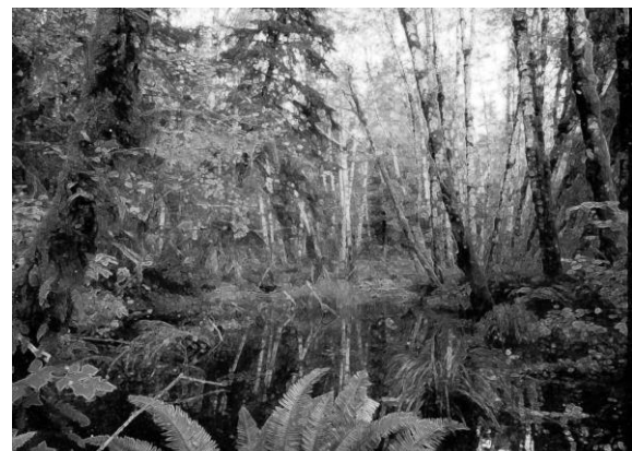
One of the wetlands found in the Bogachiel Rain Forest

TOPO MAP: Bogachiel Valley Custom Correct Map or Forks USGS Quad.