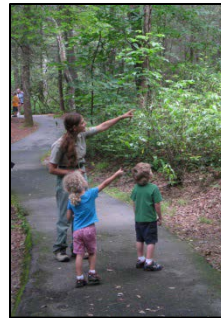
Participants in the Cradle of Forestry's Curiosity Club spy something in the trees.