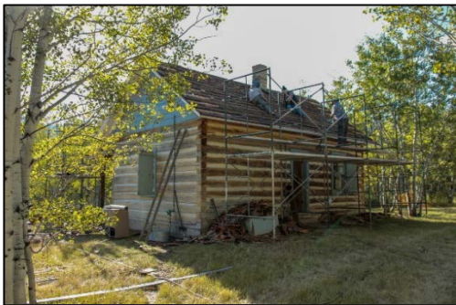
Volunteers re-shingle the Tony Grove Ranger Station.

In 2015, work began to revitalize the Tony Grove Ranger Station so it could be made available to the public as part of the recreation rental program. The log cabin first served as a ranger station in 1907 and later as an office for the Tony Grove tree nursery until 1954, it saw regular use by Forest Service employees until severe rodent damage closed it in 2009. With its 110 th birthday looming, the cabin was a perfect Passport in Time project. Skilled volunteers replaced the cedar shingle roof and constructed an accessible, historically-correct outhouse. Restoration efforts will continue with the goal of completion in 2016.