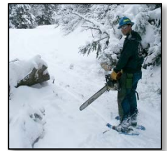
Clearing winter trails for cross-country skiers.