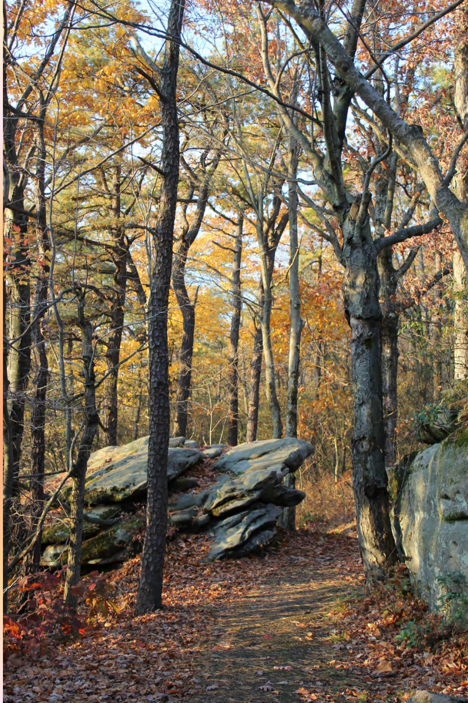
Jakes Rocks