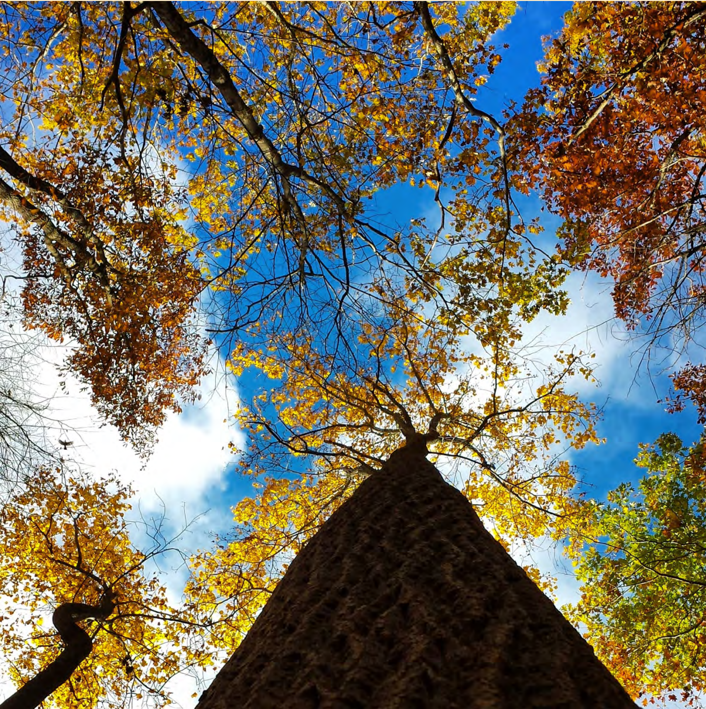
Fall Poplar