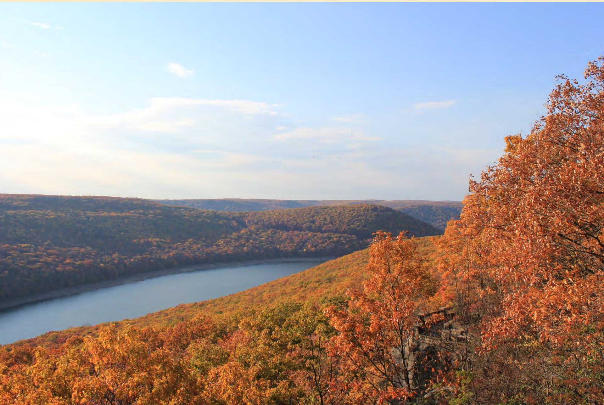
Rimrock Overlook