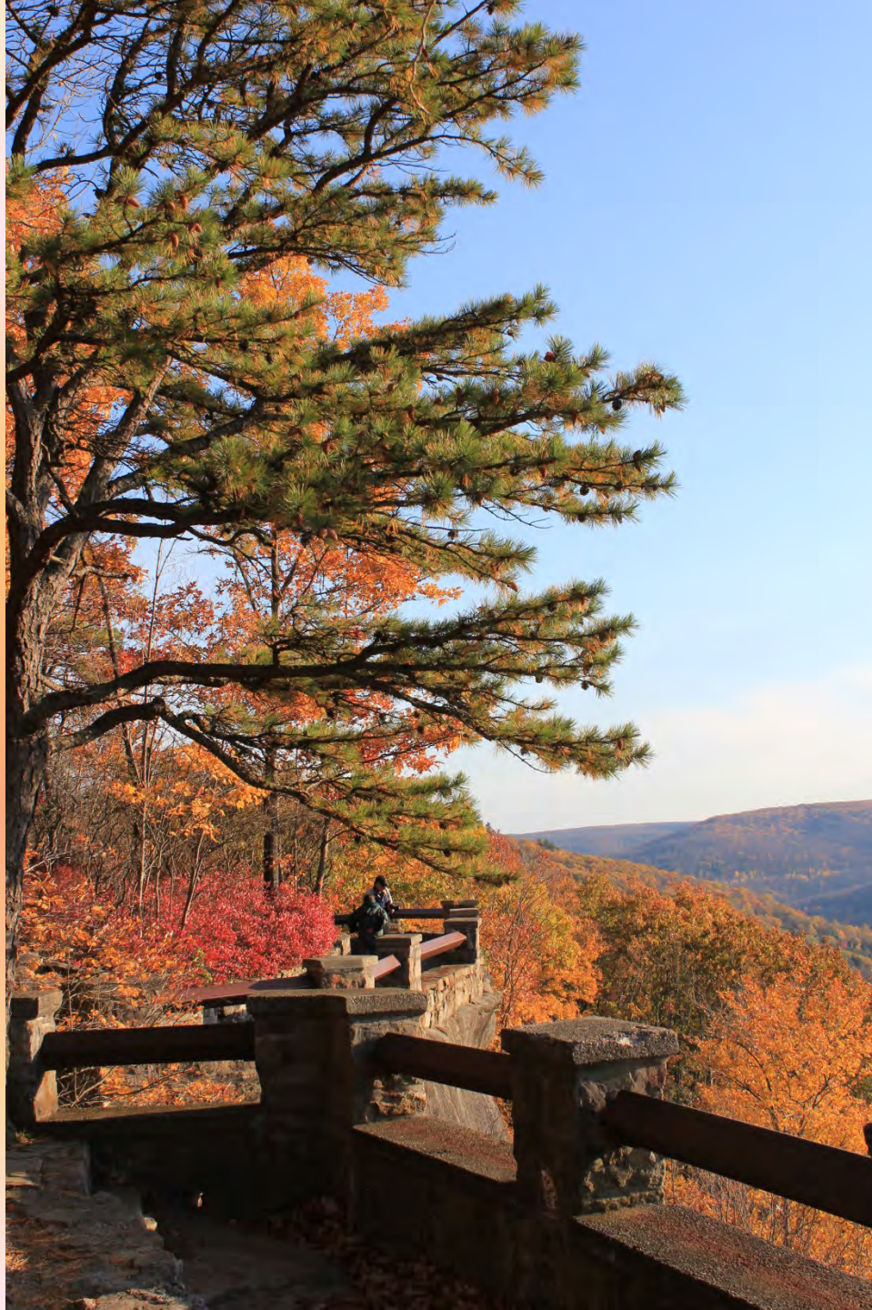
Rimrock Overlook