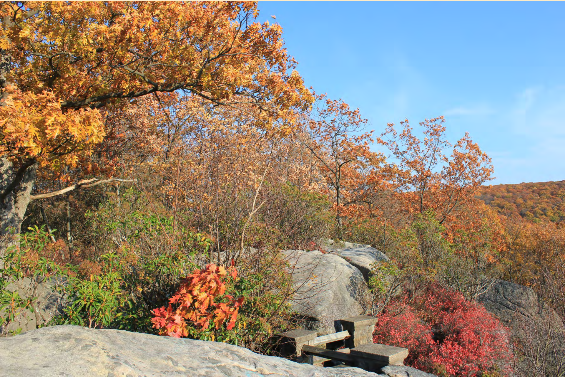
Rimrock Overlook