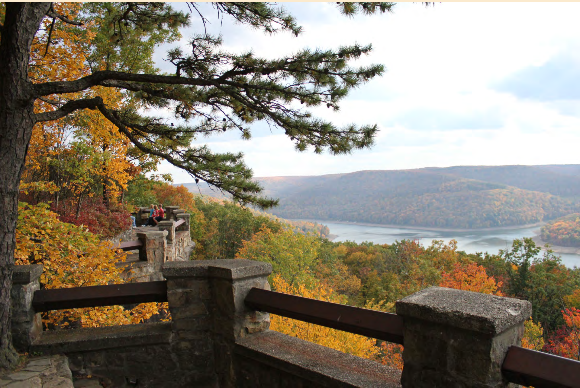
Rimrock Overlook