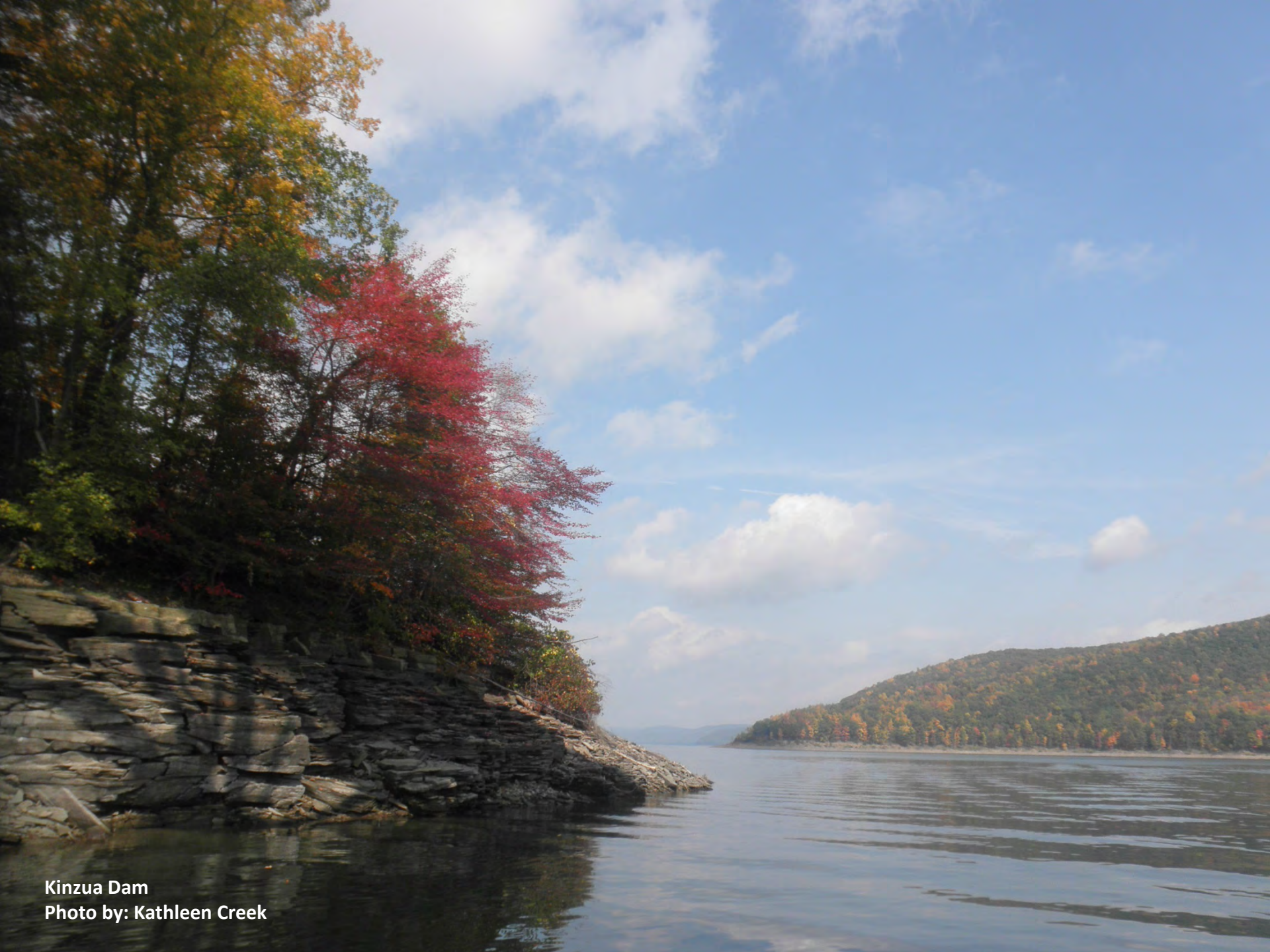
Kinzua Dam