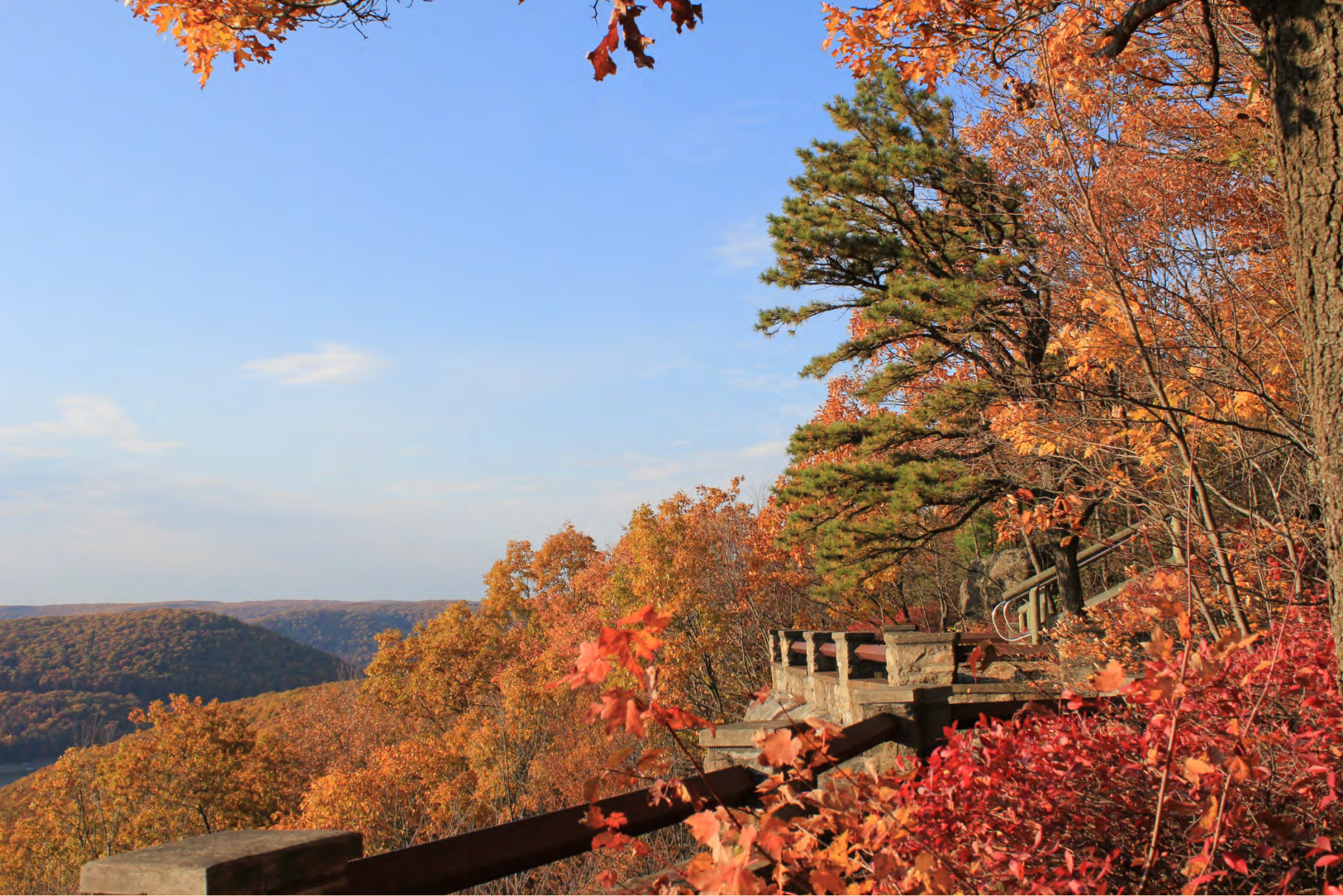
Rimrock Overlook