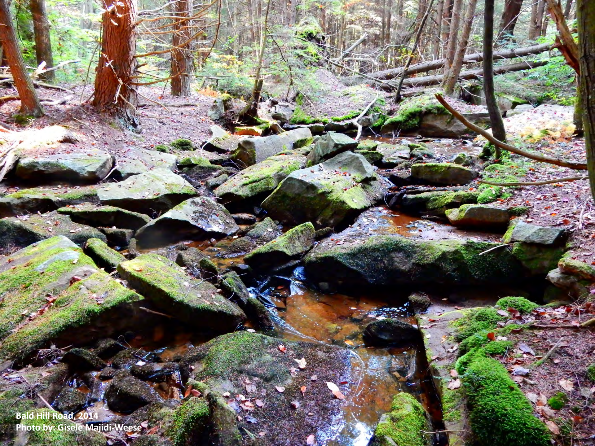
Bald Hill Road, 2014