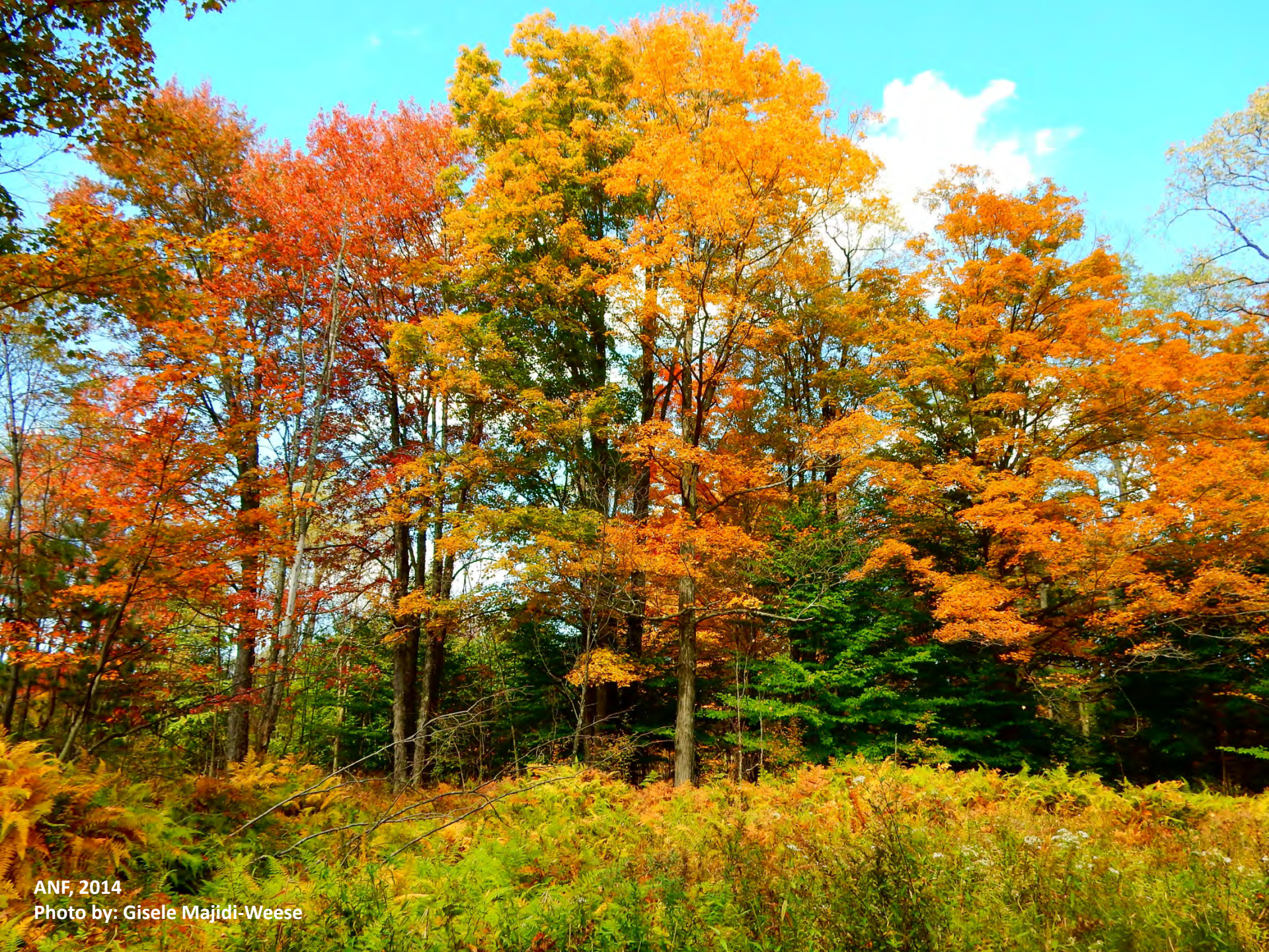
ANF, 2014 Photo by: Gisele Majidi-Weese