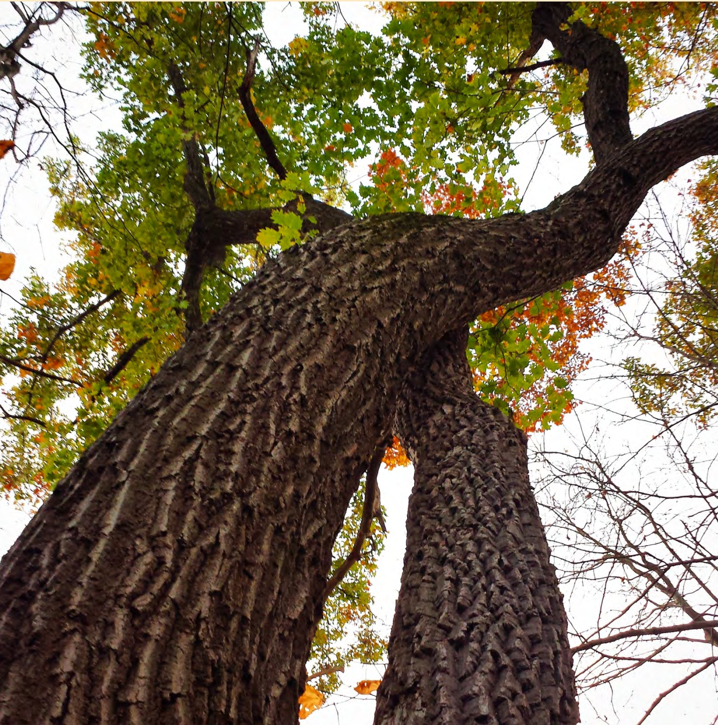
Twisted Oaks