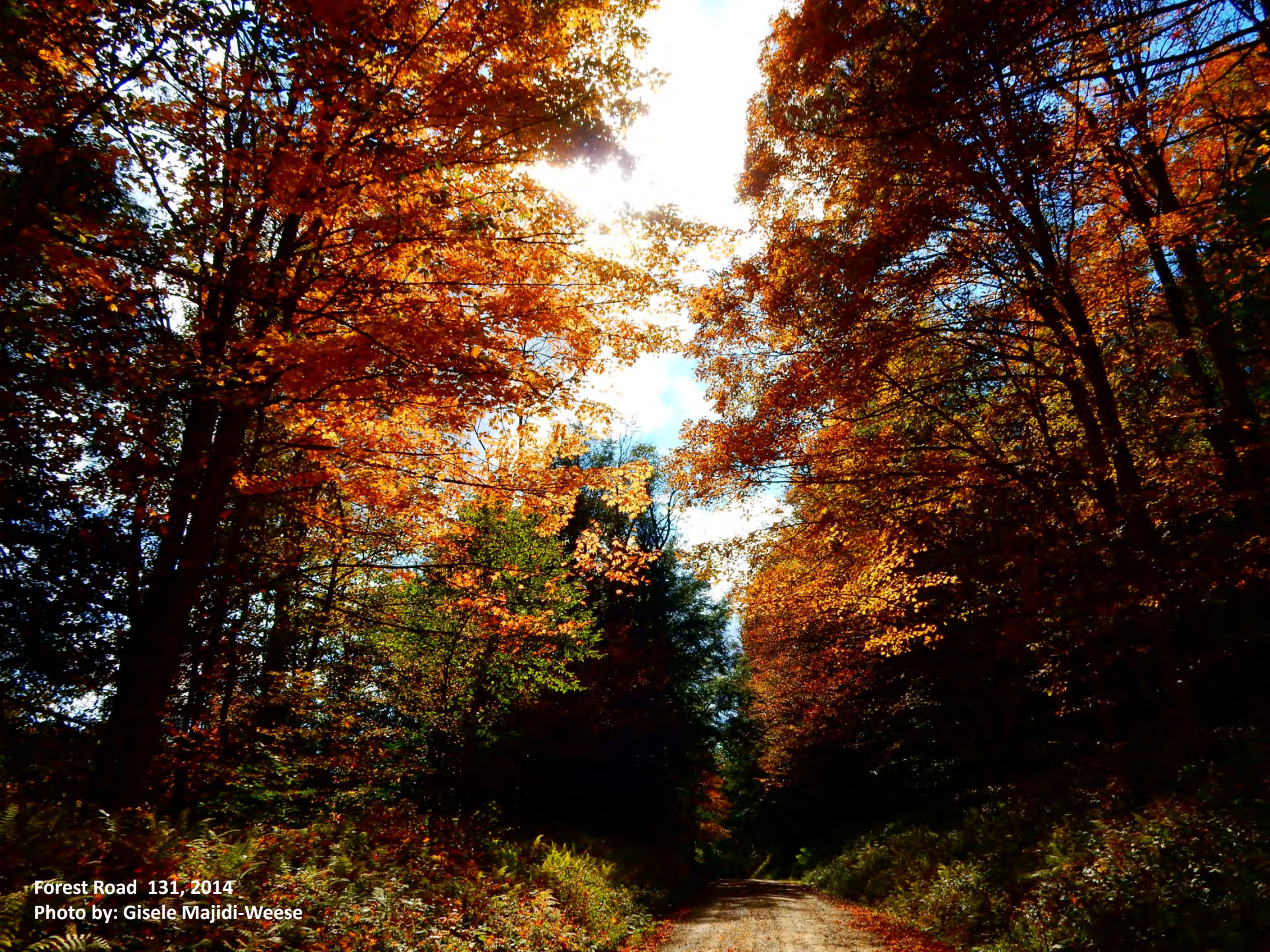
Forest Road 131, 2014