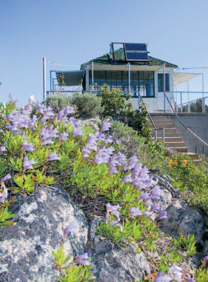
Silver Creek Lookout