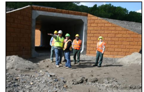
Box culvert under highway for ATV travel

USDA is an equal opportunity provider and employer.