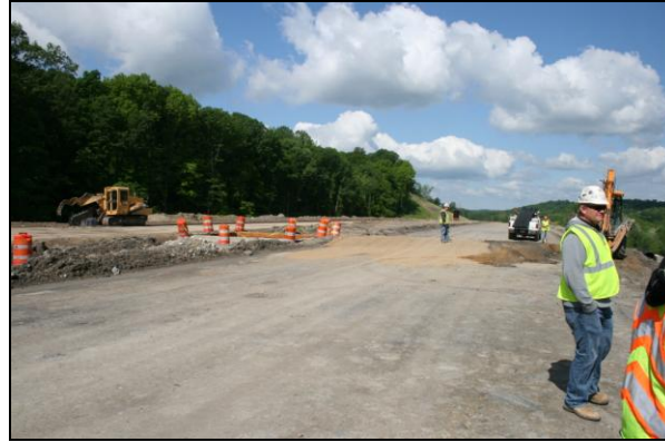
US Highway 33 near Haydenville, OH

The bypass project will temporarily impact the southern portion of the Dorr Run Loop ATV (all-terrain vehicle) trail system near Company Road for approximately five years beginning as early as April 2007.