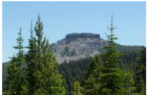
Castle Rock located east of Nez Perce Pass

Visitors are encouraged to stop and ask questions about maps, road conditions, weather and any other concerns. After office hours, a map is available outside the office.