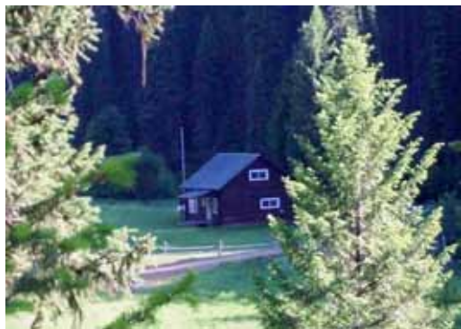
Magruder Ranger Station Office

The Magruder Ranger Station is located 1/2 mile from Road #468. The elevation is 4100