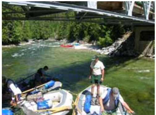
Rafters at Paradise

A Forest Service administrative site is adjacent to the Paradise Campground with a cabin, barn and corrals.