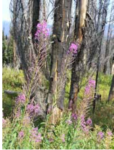
Fireweed is abundant on the landscape after a wildfire

Also, you can find good examples of "ghost" trees on the mountain. These whitebark pines were killed by a combination of mountain pine beetle and blister rust attacks. They became bleached from the summer sun, giving them a ghost-white appearance.