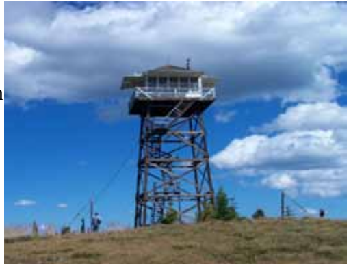
Green Mountain Lookout

The Southern Nez Perce Trail parallels a portion of the Magruder Corridor Road. The Nez Perce Indians found a practical hunting/gathering route that followed the South Fork of the Clearwater River to the rolling country and lush meadows near Elk City and the upper Red River drainage. The trail went south of the extremely difficult terrain of the Selway-Bitterroot Wilderness, and also avoided the more rugged portion of the deep, narrow Salmon River canyon.