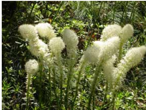
Beargrass along the corridor

As a result of this event, many places bear the name "Magruder," among them the road on which you are traveling.