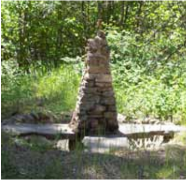
Water Fountain Built by CCCs

The lookout is staffed during fire season. The West Fork and Red River Districts can contact the tower by radio for permission to visit.