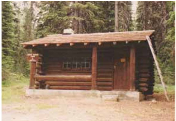
Horse Heaven Cabin

The cabin is south of the road on the spur road marked for Trail #028. The one-room log cabin is on the Forest Service cabin rental program and will accommodate four people. Reservations are made through www.recreation.gov . Information is available at the West Fork Ranger Station.