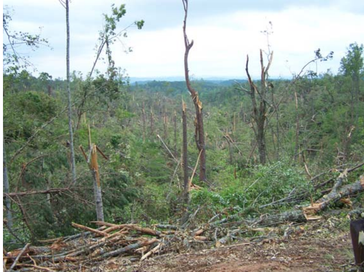
Mothers Day Tornado Damage along Talladega Scenic Drive