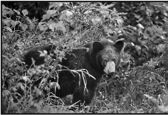
Bears are common, but you probably won't see one along the trail.