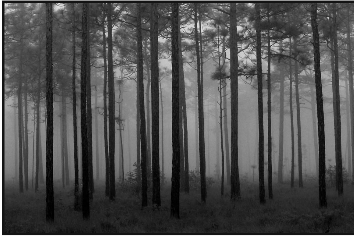
Along the Neusiok Trail are forests of longleaf pine.

In between, the trail crosses cypress swamps, hardwood ridges, longleaf-pine savannah and pocosin—shrubby bogs common to the Carolina coast. Look for signs of those who walked this way before—from native Indians to early settlers, woodsmen and moonshiners.