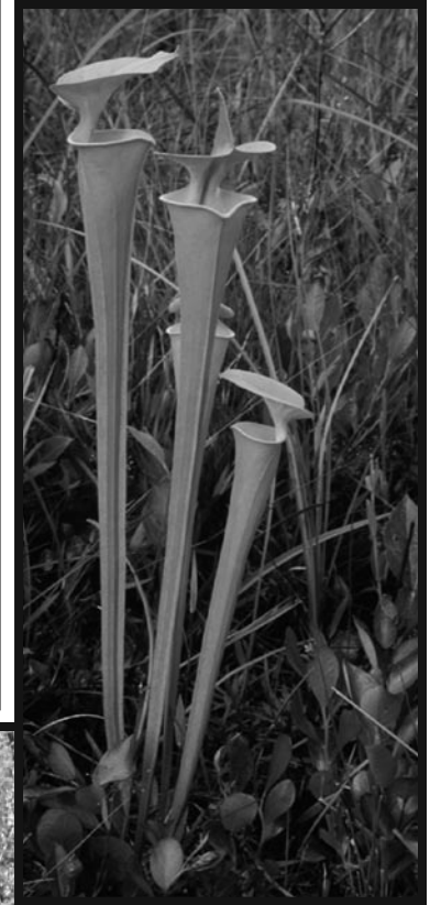
Wet places along the Neusiok Trail are home to pitcher plants (above) and bald cypress trees (left).

Hunters sometimes walk the Neusiok, so during hunting season—October through December—it's a good idea to wear a bright orange hat or vest.