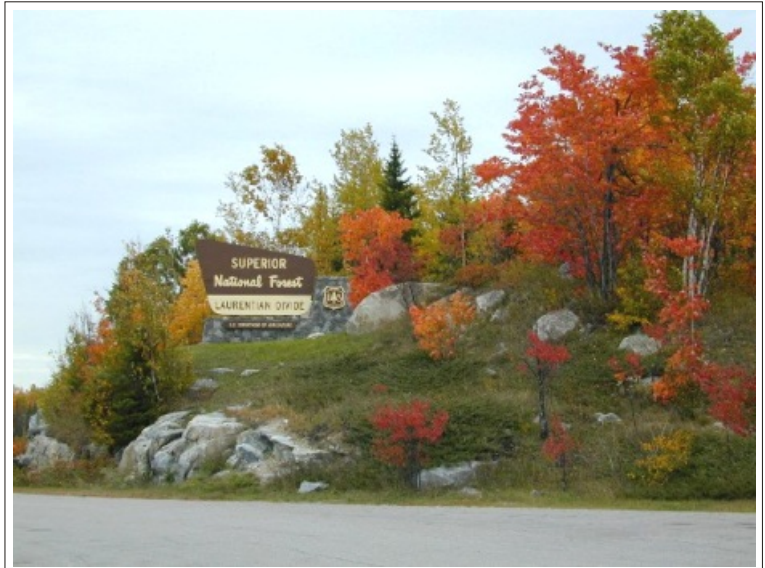
The Laurentian Divide Picnic Area parking lot is the trailhead for the Lookout Mountain Trail system.