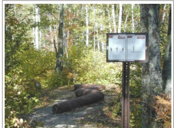
Laurentian Divide Fitness Trail, part of the Lookout Mountain Trail System.