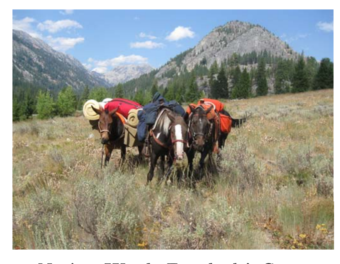
Noxious Weeds, Everybody's Concern

Noxious Weed Free Forage and Straw Certification Program