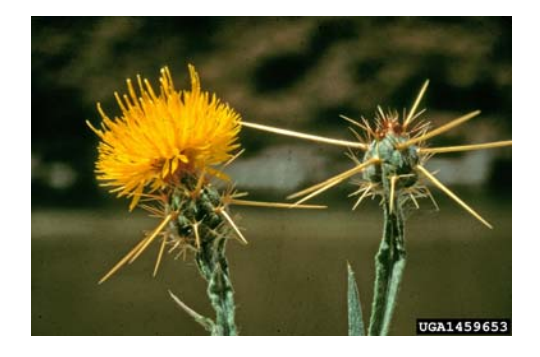
Yellow starthistle, causes chewing disease in horses