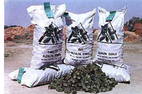
Certified Forage Cubes

How will I know if I am purchasing Certified Noxious Weed Free Forage and Straw? You will know you are buying Certified Noxious Weed-Free hay or straw bales by the ISDA certification bale tag (made of vinyl) attached to the bale twine.