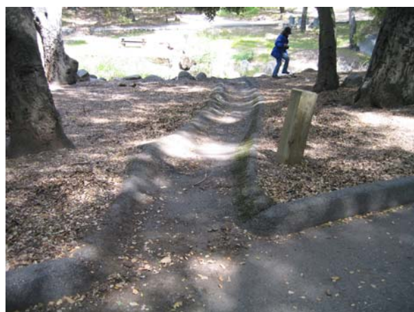
Upper San Juan Campground: On the left, a closed campsite. On the right, road drainage.