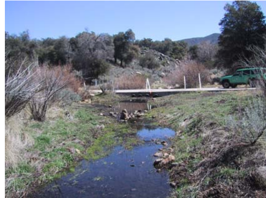
Pine Creek Tract, located adjacent to Pine Creek, is managed to protect heritage and resource values.

The Place emphasis to conserve species is carried out through efforts such as designated access routes in the tract and seasonal restrictions. The involvement of permittees in this effort is consistent with the Place emphasis to enlist others to actively participate in managing, planning, designing, maintaining and monitoring resource conditions, and to help resolve problems as they arise.