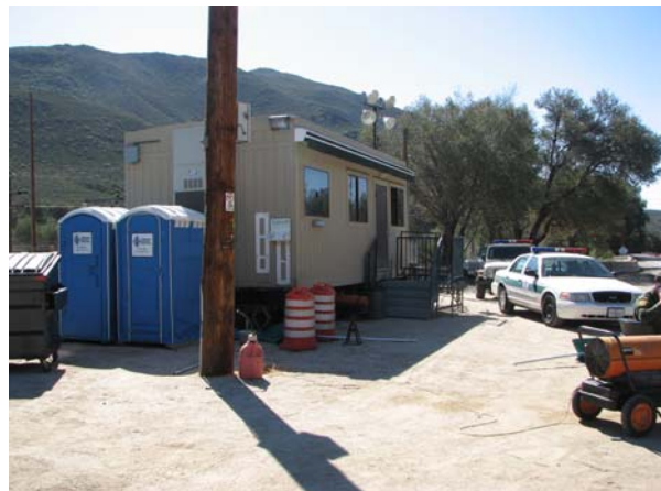
US Border Patrol checkpoint.