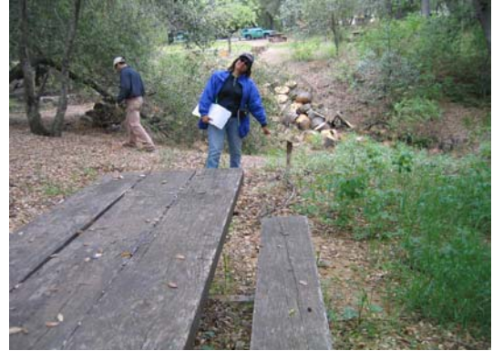
El Cariso Picnic Area (riparian area in background).

The signage looks good. Tables are old but functional. One barbeque in the rear site across the walkway is deteriorated. This lone picnic site is inconspicuous and probably poorly maintained because only one recreation field staff is trying to cover for multiple vacant recreation jobs and was not aware of its presence. There have not been any recent maintenance projects.