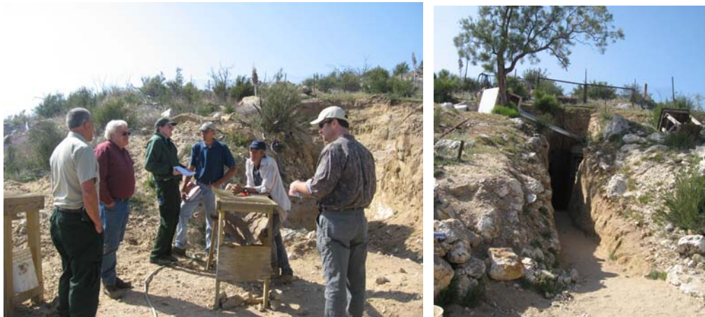
(L) Team listens to operator explaining operations and plans. (R) Mine entrance.

The Cryo-Genie gemstone mine of the Palomar Ranger District was evaluated with the District Recreation and Lands specialist. The operation has an expired permit and lacks a current plan of operation; however, planning is underway. The new permit will address water quality protective measures for access, occupancy, storage areas, human waste and refuse disposal, boundaries, erosion hazards, hazardous materials, water use, process water disposal, and site reclamation. The mine had a hydrologic inspection in the fall of 2006 and the recommendations for containment of oils and generators were implemented. The current access road has a steep area that requires a rolling dip and continued maintenance. The new permit has a section analyzing the changing of the access road to reduce the grade and reduce erosion potential. The BMP effectiveness protocols did not identify any sedimentation transport issues. The implementation evaluation indicated that the mine did not meet guidelines. When the Plan of Operation (POO) is next updated, all BMP aspects should be addressed, even if they are not applicable.