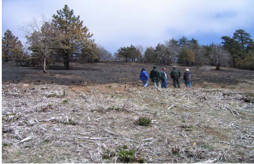
Mastication in foreground; area shown in background was also burned.