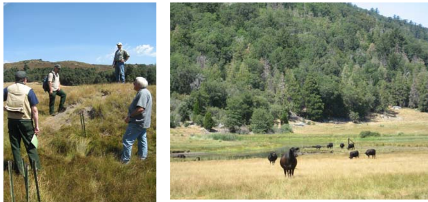
Mendenhall allotment. On left the team reviews stabilization structures.

The evaluated meadow was acquired from the Mendenhall family in the 1970s. Prior to the acquisition of the land, year round grazing was the standard method. After acquiring the land, the management was changed to seasonal use and half of the animal units were permitted. Water from this meadow drains into Lake Henshaw. In the 1980s a large gully (that was formed by a 1936 storm) was raised by more than 3 feet and stabilized. At the time of this survey, the upper structures had been buried in. The gully corridor is about a half mile long. Walking the entire length of the gully revealed that 80% of the banks were in a stable condition (meeting the effectiveness protocol for channel stability).