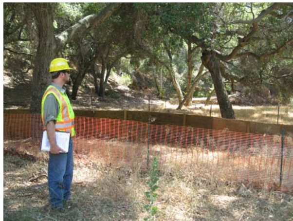
Decommissioning of Lower San Juan Picnic Area to protect riparian habitat.

In acquiring the necessary permits, CalTrans was informed that they would get a “jeopardy” opinion if they did work in the channel due to the presence of species. To avoid the channel, CalTrans has implemented a large number of BMPs, and uses on-site inspectors and ongoing surveys. Two areas were visited on August 28, 2008. The first was the Lower San Juan Picnic Area. In coordination with the Forest, CalTrans is going to close this area to protect species.