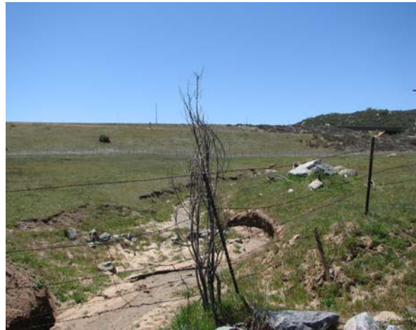
Guatay allotment (Roberts Ranch). On the right, Highway 8 can be seen in the background.

The cultural resource barrier is operational.