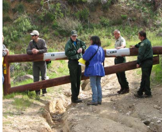
Post Witch Fire damage on Lusardi Road. Team discusses consistency with road BMPs and LMP.

The road maintenance COR (road engineer) states that operational controls were implemented during maintenance, but that the road was subsequently damaged by Witch Fire. A low water crossing was inspected along a perennial creek. The maintenance contract was for surface blading and drainage repair and return of watershed function. The contract has language indicating that CalTrans BMPs should be used. This system works sufficiently along with pre-work meetings when the Forest engineering specialist and the contractor are familiar with these BMPs. If a situation arose where the contractor was inexperienced, then there could be a problem. There was evidence of rilling on less than 10% of the road length and when present, the rills did not leave the road surface. There was no evidence that sidecast material was put in the RCA. Road 11S03 has been closed due to the Witch Fire and the subsequent intense storm year. The protocol for closed roads is to check them prior to maintenance being conducted. In the area of the fire, and under the influence of the current storm year, more than 10% of the road had rills greater than 10 feet in length which continued off the road surface. There was also some rutting and delivery of sediment into the streamside buffer area. These deficiencies were further along the road than the stream crossing that was monitored.