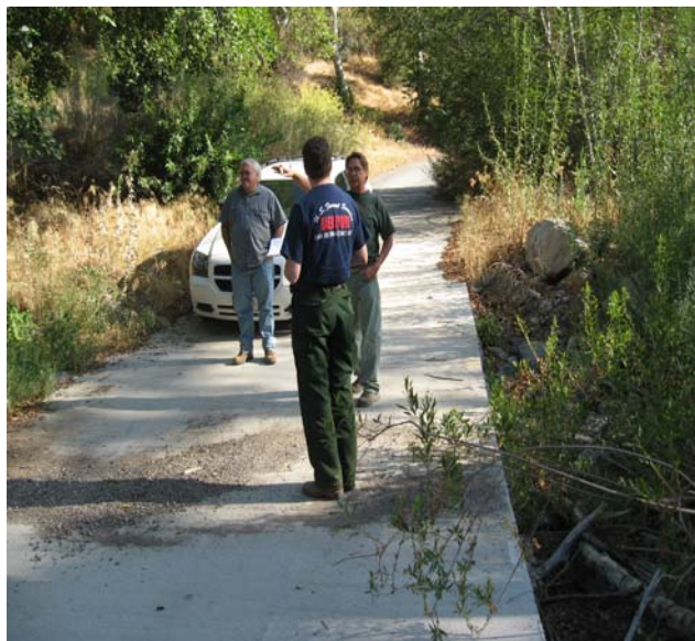
Maple Springs Road wet crossing. The team hydrologist evaluates the inchannel construction.

Road 5S04 (Maple Springs Road) is part of the Silverado Canyon watershed. As part of the Forest roads analysis (RAP), the road rated as high risk. The area is highly unstable and there is a lot of riparian vegetation and five road crossings. There are endangered species issues in the creek. In the past 16 years, there have been only five years when the road has not washed out. With these considerations in mind, the Forest chose to chip seal the road and provide low water in-channel crossings for the lower area. The road becomes dirt with rolling dips and overside drains when it leaves the riparian habitat. With the chip seal construction and the maintenance on the upper level, the road has no evidence of rilling and no sediment was seen to be delivered to the RCA or channel. The stream crossings are all functioning well and habitat is returning. No evidence of sidecast material was seen.