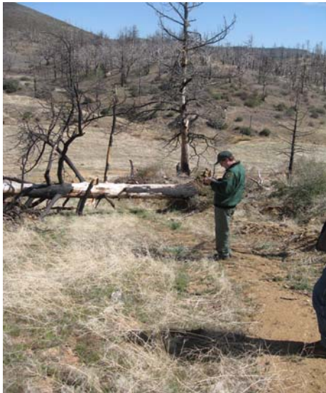
Decommissioned unauthorized route

There are no NEPA projects to evaluate. At the time of the LMP review, the road was closed by downed trees about 1/2 mile in, and berms and fill had removed the road from being used.