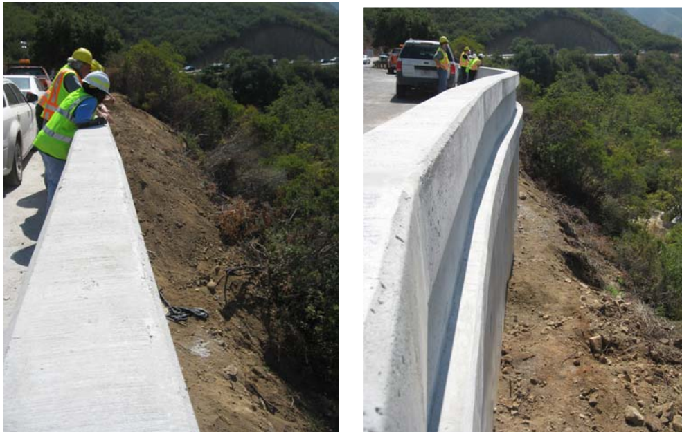
Cal Trans and Forest Service officials review use of best management practices.

Intensive protection measures for arroyo toad were implemented effectively at the picnic area restoration site. The silt fences, slash spreading, fiber rolls, and planned mulching, as well as the constant surveys and inspections are keeping the project from delivering sediment to the riparian areas. In completed areas, there continues to be inspections. As the project is ahead of schedule, the permanent erosion control will not be implemented right away. As such, temporary erosion control measures are being put in place until the end of the project. Interaction with Forest engineering and biology staff continues to monitor the success of this project. The final phase of the project will be restoration of native vegetation now that the picnic tables and road/parking area have been removed. The arroyo toad fence will be left in place until the revegetation project is complete.