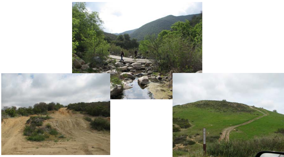
Above, South Main Divide crossing. Below, unauthorized routes off the road.

The South Main Divide crossing evaluated is old but in good shape. The road itself is in good condition. The cable along roadside is not an approved guard.