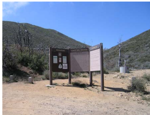
Pioneer Mail trailhead post-Cedar Fire (L); and today (R).

There have been no recent NEPA decisions associated with site and there are no biological or archaeological requirements to implement.