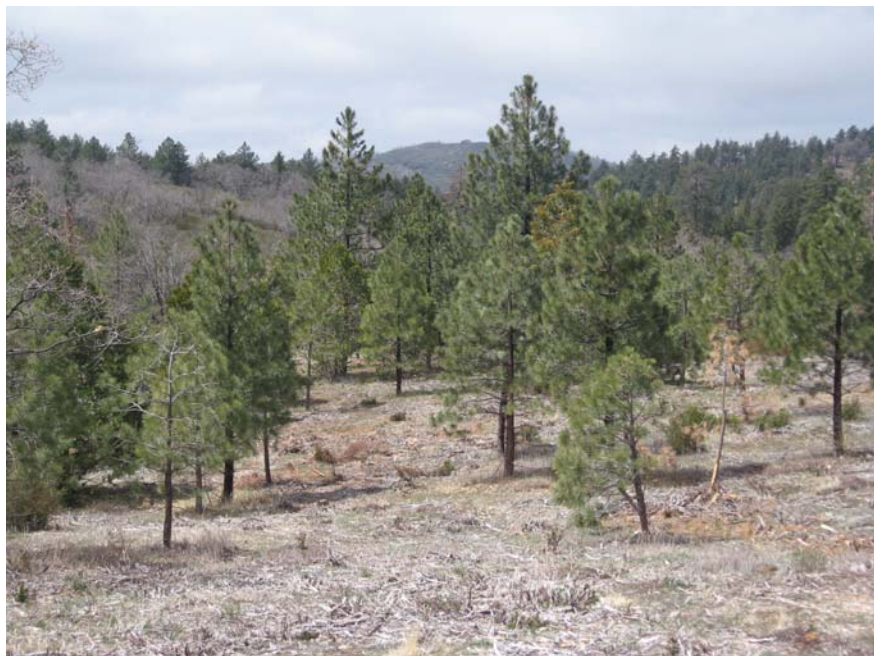
Laguna Mountain mastication

The monitoring team visited the road on April 9, 2008 to review consistency with the Forest Land Management Plan and also for Best Management Practices evaluation (Vegetation Manipulation V28). The project used rubber tracked light equipment.