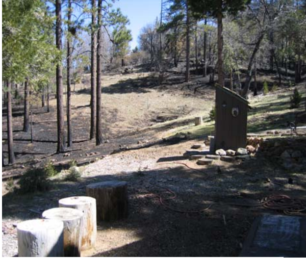
Shows tract after successful prescribed burn; unauthorized cutting of timber is also evident.

Due to historical values all proposed changes go through Forest archaeologist and SHPO. One of four cabins was out of compliance and found in willful violation of terms and conditions and fined. The numerous violations included cutting trees and grading of the area. Since then, the area has been re-graded and reforested. The water tank was removed. Statues not cemented to the ground were removed; concrete statue removal is underway. Non-native vegetation (daffodils, juniper) were removed. Most of the unauthorized actions have been addressed. The permit administrator has a few remaining issues left to resolve. No special tract management is needed for species per BA/BE.