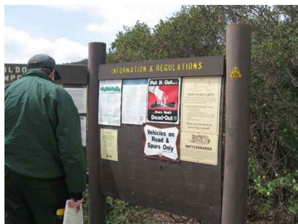
Wildomar Campground: (L) barriers protecting riparian values; (R) sign restricting vehicles to roads and spurs.

Recreation staff that maintain the site provide the District Recreation Officer with weekly reports detailing work done and work needs. Recommendations for improving this site include adding