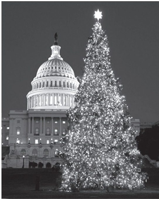
The 2005 Capitol Christmas Tree, from New Mexico and the Santa Fe National Forest

Finding the perfect Christmas tree to celebrate the holidays is an American tradition shared by many, but it can be a daunting task. So imagine trying to find the perfect Christmas tree to display in front of the Nation's Capitol.