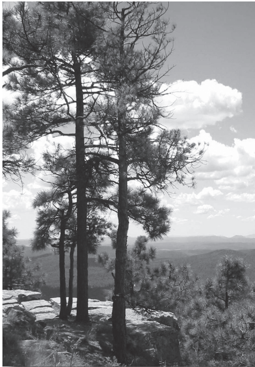
View from the Mogollon Rim, Apache-Sitgreaves National Forests

In my last assignment, I served as the deputy director of Ecosystem Conservation in the Pacific Southwest Region of the Forest Service in Vallejo, California. I have over 30 years experience with the Forest Service and have worked in several western states and Washington DC. Along with my management experience, I have a scientific background in forestry and hydrology.