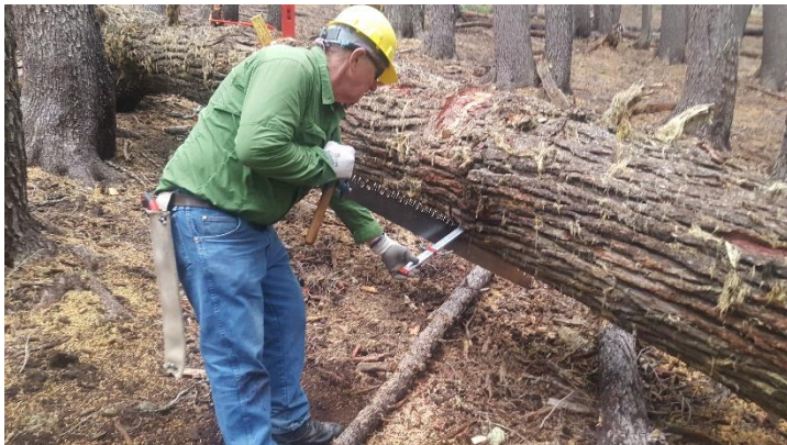
Recent photo of a volunteer removing windfall on the Mirror Lakes Trail, Three Sisters Wilderness. Many trails still have moderate to heavy downfall on them.