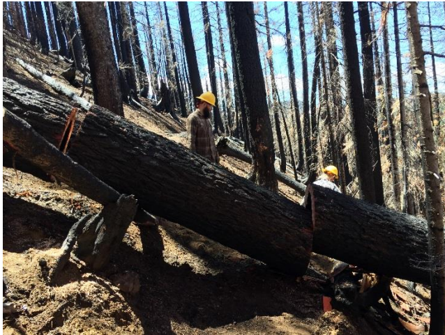
Volunteer logout on Pacific Crest Trail, south of Lava Camp Lake, in late-June. 2017 wildfires, such as the Milli Fire, brought heavy downfall and erosion problems to several trails. Be sure to thank volunteers when you see them on the trail!