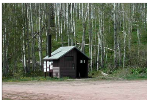
Vaulted Toilet at Horse Ranch Park