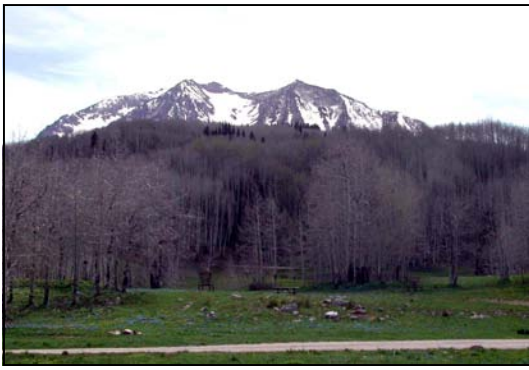
Picnic table & manger in Horse Ranch Park. East Beckwith in the background.