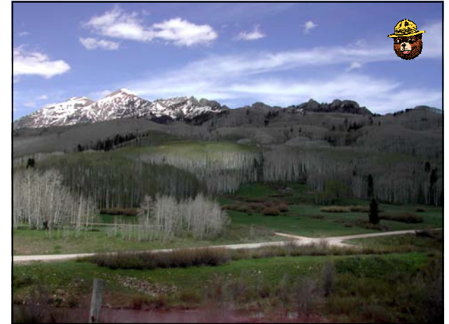
A View of Horse Ranch Park taken from the Cliff Creek T.H. The Ruby Range & Dyke in background

Gunnison National Forest Paonia Ranger District