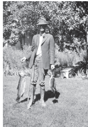
1924 Rainbow Trout