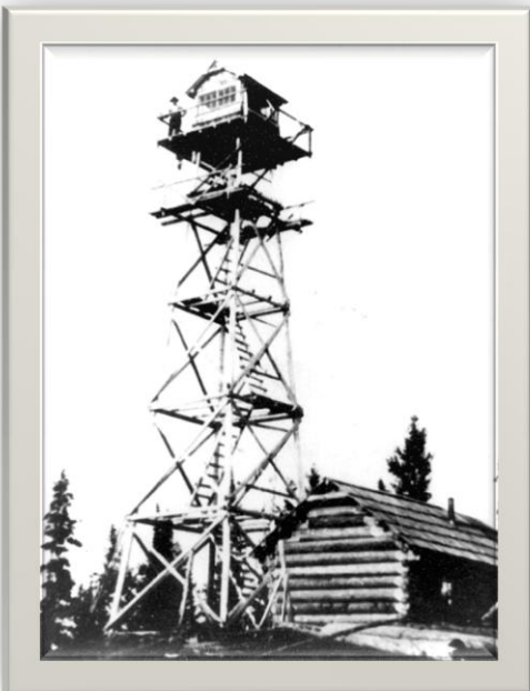
Dairy Mountain Lookout, 1940s. This pole L-6 tower was 50' tall with a gable roof. Built in 1945, Dairy Mountain Lookout was located twenty miles NNE of Riggins on the Salmon River Ranger District. It was removed in 1960.

The L-6 is an 8 x 8 foot frame pre-cut lookout house, an even smaller version of the L-4. It was built atop tall wooden towers with separate living quarters on the ground.