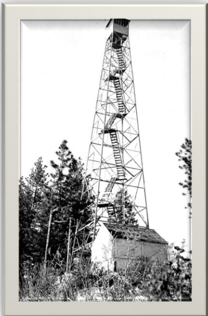
Quartz Ridge Lookout, 1953. This 100' steel Aermotor tower was built in 1934. It was located twelve miles SE of Grangeville on the Clearwater Ranger District. It was removed sometime after 1969.

Aermotor refers to the Aermotor Company of Chicago, Illinois, famous for their windmill towers. The lookout towers of this type are more frequently found in the southeastern United States and are somewhat rare in the Pacific Northwest.