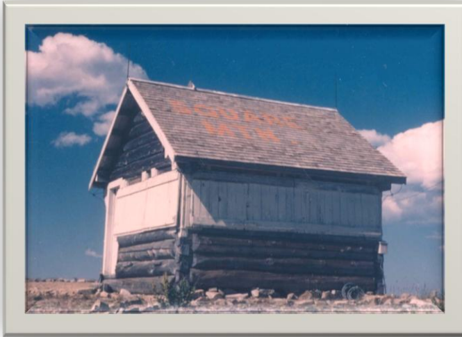
Square Mountain Lookout, 1960. An L-5 style, this log lookout is a ground cab with a hip roof. Built in 1931, the lookout has been restored and is used on an emergency basis. Square Mountain Lookout is located on the Salmon River Ranger District.

The L-5 is a 10' x 10' frame pre-cut lookout house (smaller version of the L-4) built mostly at secondary lookout points in the 1930's. The term "L-5" was also given to a handful of 14' x 14' gable-roofed log cabins in Idaho and Montana.