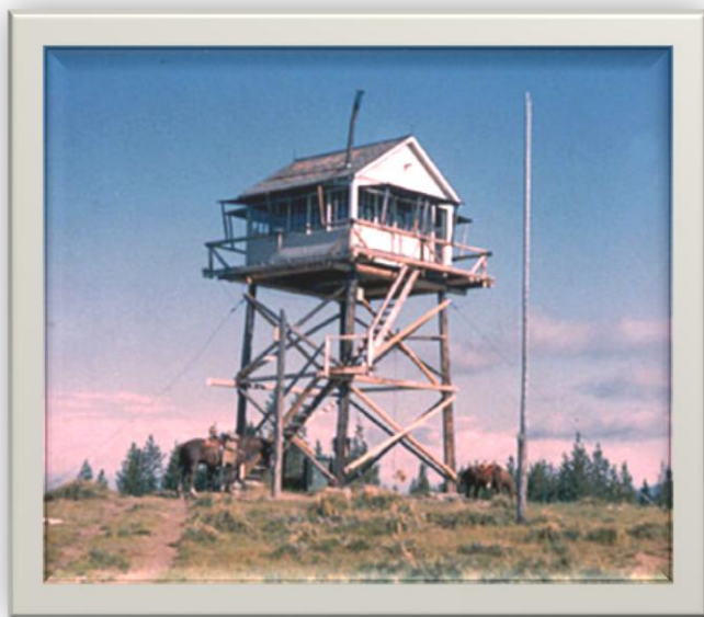
Blackhawk Lookout, 1950s. This pole L-4 tower was 20' tall with a gable roof. Built in the 1930s, Blackhawk Lookout was located eight miles east of Elk City on the Red River Ranger District. It was removed in the 1950s. USFS photo

The L-4, also known as an "Aladdin", is a standard 14 x 14 foot frame pre-cut lookout house built from 1929 through 1953. It has a peaked roof and wooden panels that are mounted horizontally over the windows. The panels provide shade in the summer and are lowered over the windows in winter. Early models have a gable roof; later models have a hip roof.