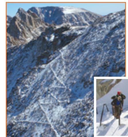
Switchback near Trail Crest, early October 2010

Above information courtesy of Kurt Wedberg, Sierra Mountaineering International