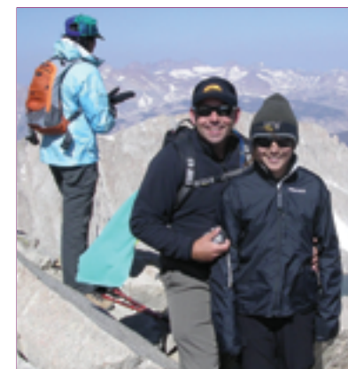
Dressed for the summit in summer

November-April: Winter prevails, with deep snow and very cold temperatures. Winter storms may drop several feet of snow and have winds over 100 mph. The road to Whitney Portal is usually closed 8.3 miles from Lone Pine (at elevation 6,400 ft., about 3 miles from the trailhead) from mid-November to late April.