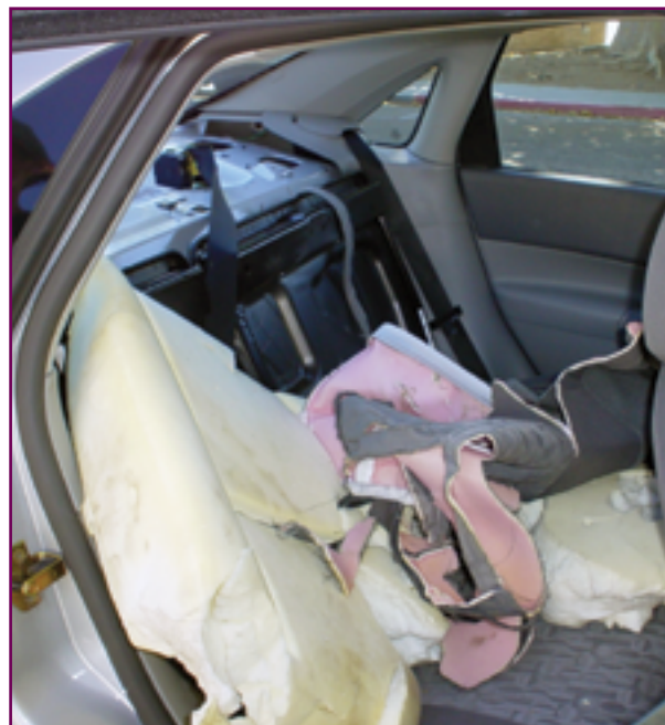
Damage by bear getting to food left in trunk

Bear canister rental locations: InterAgency Visitor Center in Lone Pine; Whitney Portal Store; and sporting goods stores in Lone Pine.