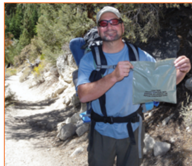
Each year, hikers packed out almost 7,000 pounds of waste

Disposal: Dispose of used kits only at the receptacle at the trailhead, next to the trailhead toilet.