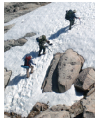
Above Outpost Camp in May