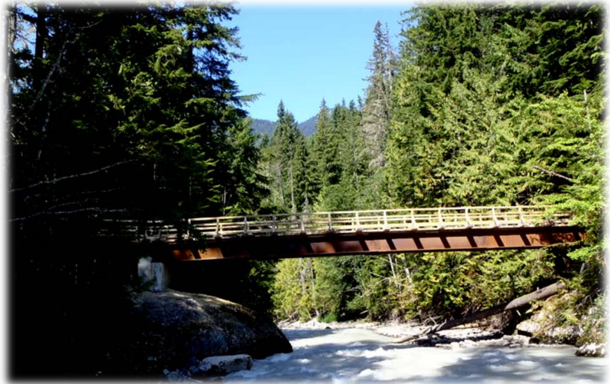
Bridge constructed by Clarence McReynolds Trail Construction , completed September 2011.