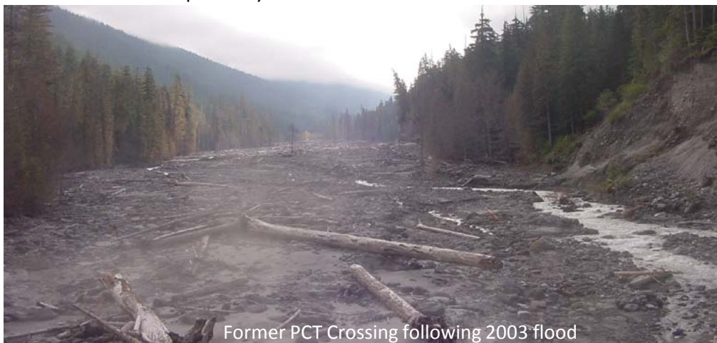
Former PCT Crossing following 2003 flood