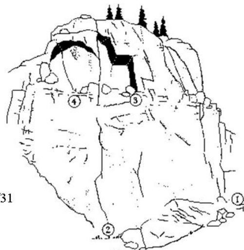
Noontime Rock Closed to Entry 4/1-7/31