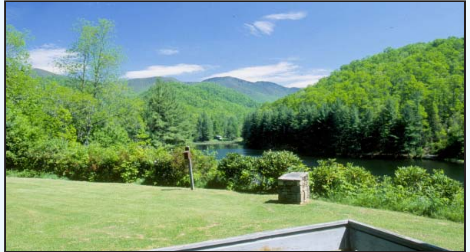
From the lodge porch, guests can get a view of the placid Balsam Lake and Blue Ridge Mountains.

Located in Jackson County, the lodge overlooks Balsam Lake and offers spectacular mountain views.