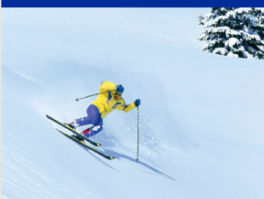
Obey closure related signs.