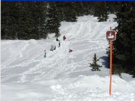
Motorized users — watch for and yield to pedestrians, non-motorized users, and others playing in the snow.