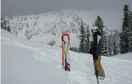
Avoid potentially dangerous areas — steep terrain, creek crossings, and overlooks.