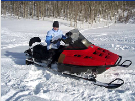
Let others know your travel plans.