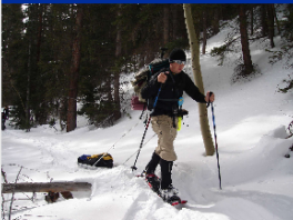
Be aware of avalanche hazards.