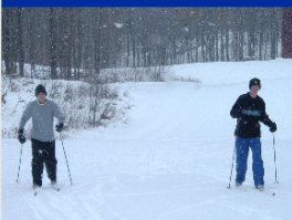
Dress for changing weather conditions.