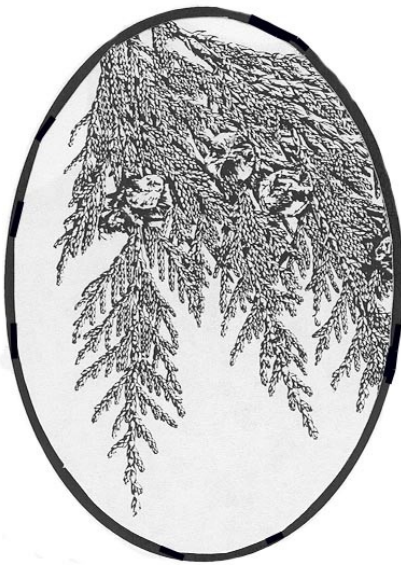
Alaska yellow cedar

Alaska yellow cedar is best at keeping its needles. However, cedar does not hold a shape as well as the other trees. Cedar boughs make beautiful wreaths and also provide a pleasant fragrance indoors.