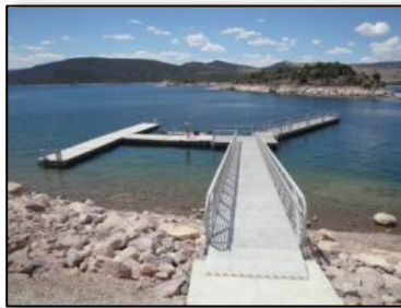
Newly installed gangway and docks at Dam Point, a Flaming Gorge Uintas Scenic Byway site and boating destination