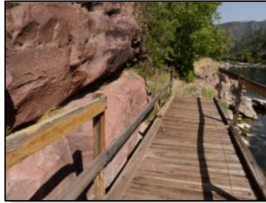
The Little Hole National Recreation Trail Bridge was repaired in 2012 using recreation fees. The bridge is shown before the repairs, above, and after, at left.