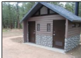
Two new double vault restrooms replaced a non-functioning flush restroom at Uinta Group