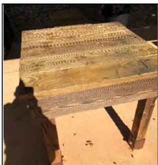
New tables at Uchee Shooting Range