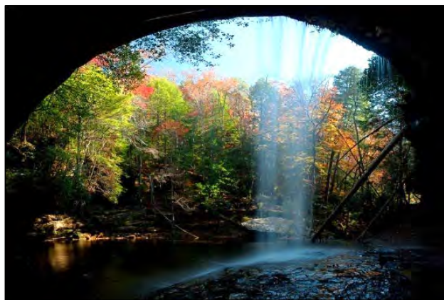
Beautiful Waterfall in the Sipsey Wilderness