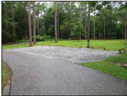
New parking area

The two new parking areas will reduce impacts to campers when they have multiple vehicles and/or guest visiting. They will also help reduce the number of vehicles parking along the road edge and make roadway passage safer for campers and motorhomes. Finally, the new areas will help with area degradation. Recreation fee dollars of $1,884.47 helped to fund this project.