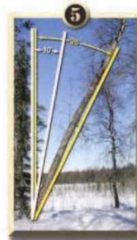
trees leaning more than 10°