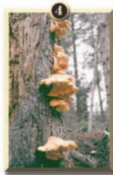
signs of disease