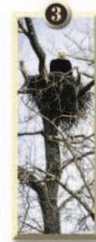
material may fall from a tree