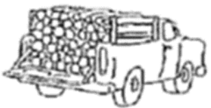
1 Cord (short bed)