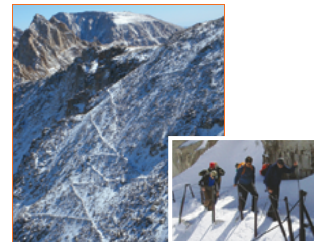
Switchback near Trail Crest, early October 2010

Above information courtesy of Kurt Wedberg, Sierra Mountaineering International