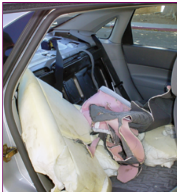
Damage by bear getting to food left in trunk

Bear canister rental locations: InterAgency Visitor Center in Lone Pine; Whitney Portal Store; and sporting goods stores in Lone Pine.