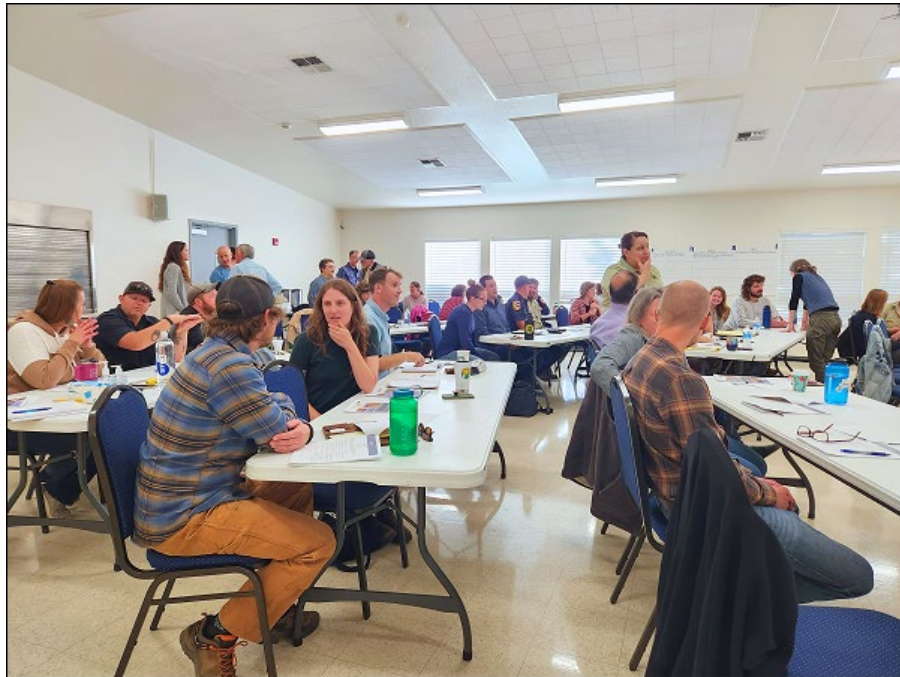
Figure 1 LNF and Partner attendees get to know one another before the symposium starts.

A big thank you goes out from LNF to our partners for attending the Partnership in Practice Symposium in October. Approximately 50 in-person attendees and 20 online attendees engaged in discussions and structured activities about what it means to partner with the Forest Service, how our individual organizational timelines overlap, and how some of our Forest processes can be more collaborative.