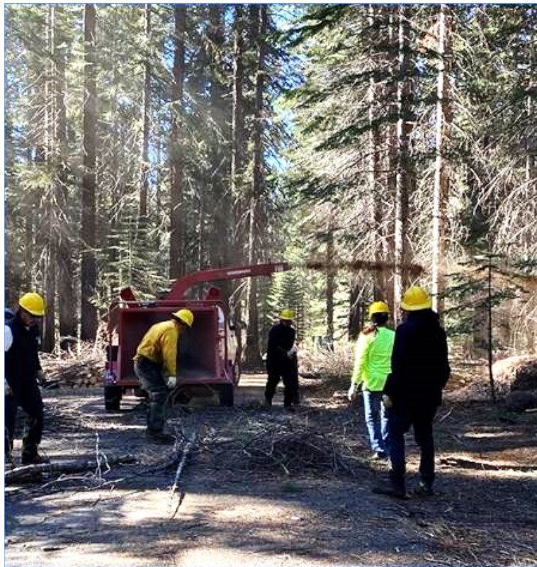
Figure 1. AFWD crew members chip material as part of a disaster recovery and workforce development project.

In 2023, the LNF partnered with the Alliance for Workforce Development to place eight Lassen County workers in administrative and recreation maintenance positions on the Almanor and Eagle Lake Districts. These employees have been instrumental in accomplishing work that allows the LNF to meet its disaster recovery and public service goals, and have gained valuable work experience in the process. A crew of seven employees painted smoke damaged facilities; replaced burned picnic tables, fire rings, fencing and parking barriers; and chipped brush and cleaned up burned and down trees at the Locherman Canyon Outdoor Classroom, Almanor North, and Soldier Meadows Campgrounds. Another employee assisted with administrative duties at the Eagle Lake District office. The Lassen National Forest would like to thank the Alliance for Workforce Development staff for their dedication to the partnership and we look forward to what the future holds!