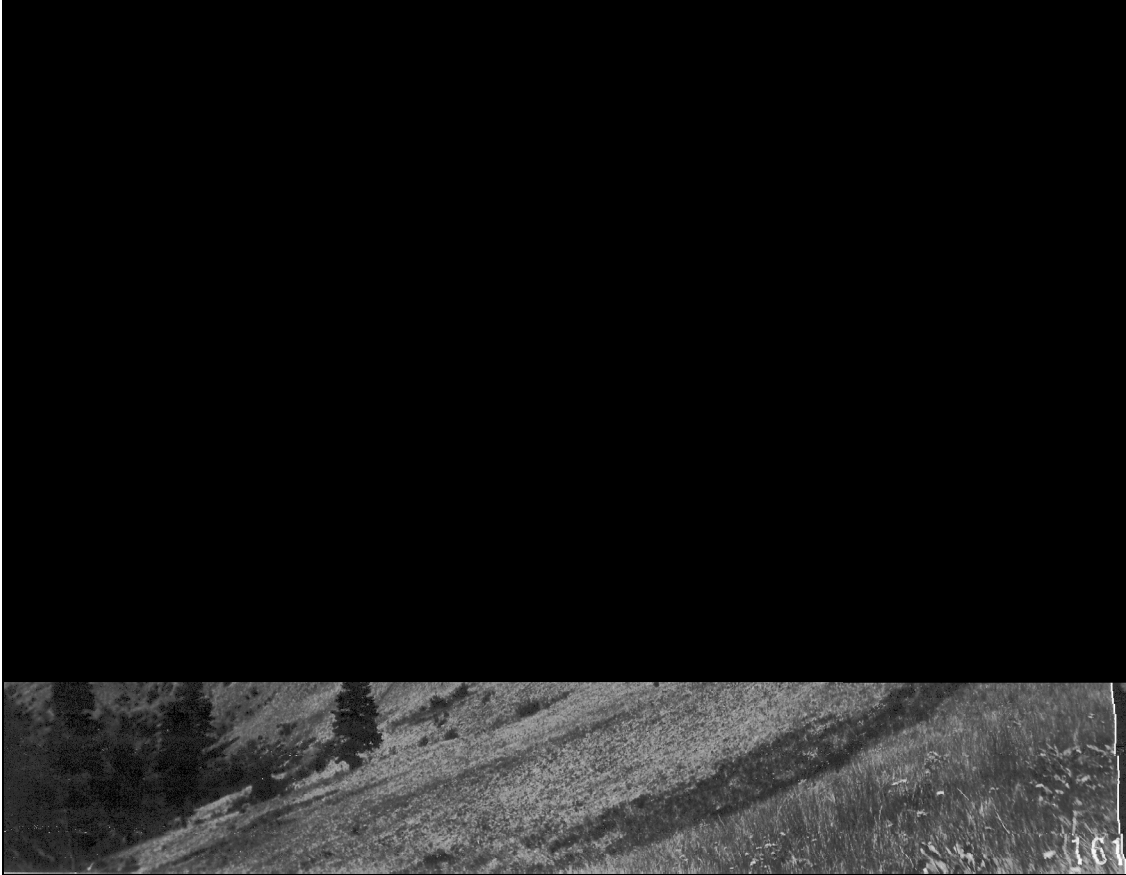
Plate 43 : "The Forest Service trail down the ridge into Tucañon Creek. Timber on the canyon walls is mostly small Douglas fir growing in the more protected places, with large trees in the bottom and running up the secondary canyons for a short distance. The irregular white object in the center of the picture is a ploughed field" (photograph taken by M.N. Unser in 1913).

[Editor's Note: Several copies of this photograph are contained in the Umatilla National Forest historical files in Pendleton, Oregon. The file copies are labelled as showing the "Hixson Gulch trail, built by Forest Service, showing switch-backs. Sec. 27, T. 9 N., R. 41 E."]