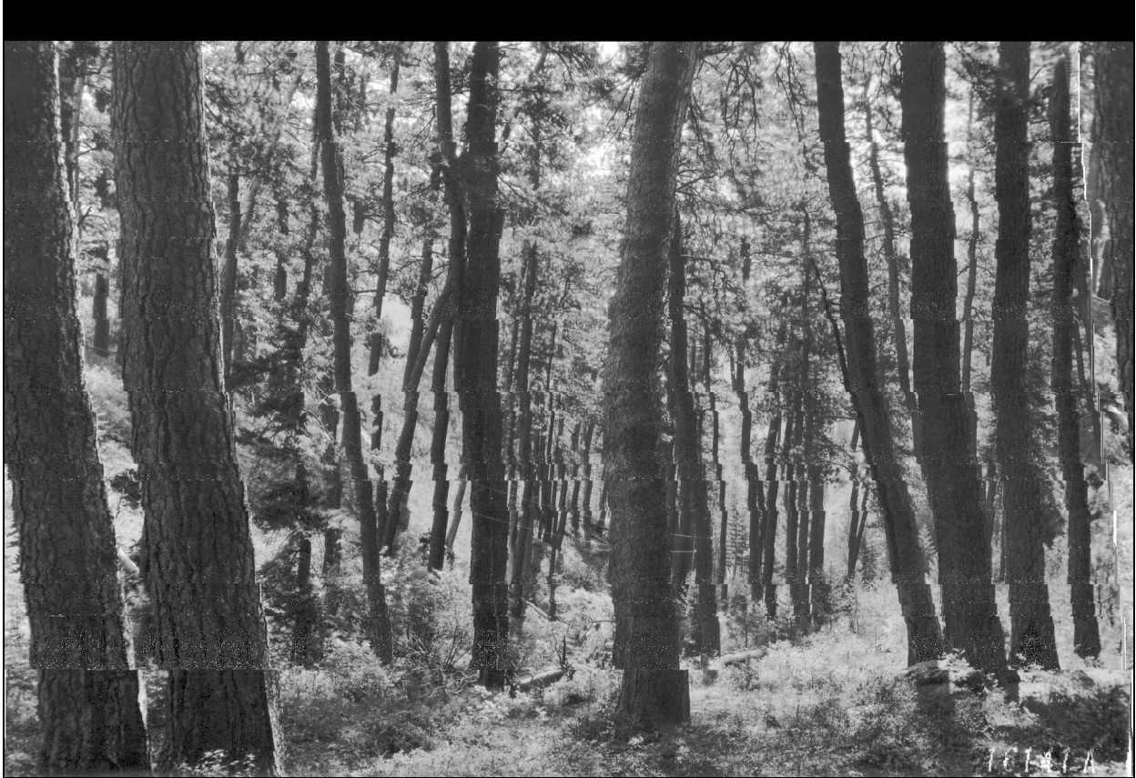
Plate 9 : "Excellent yellow pine timber in a draw tributary to Tucañon River. Areas covered by timber in such draws are isolated, although the timber itself is often of excellent quality. This is a small mill proposition".

[Editor's Note: Someone (possibly Irving Smith, Pomeroy District Ranger in 1962-1968) wrote on the original copy of the report that this photograph may have been taken in School Canyon.]