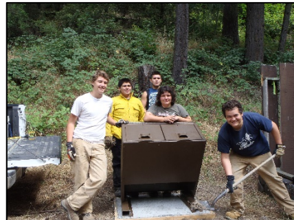
Recently installed bear boxes

The forest used recreation fee funds to install new bear proof trash and recycling cans. These new features will make East Fork Campground an even cleaner and safer place for families to recreate. Forest staff worked with the local Youth Conservation Corps crew to perform this work.