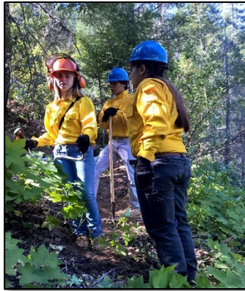
Youth Conservation Corps crew brushing campgrounds