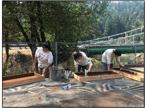
Youth Conservation Crew building fire safe equipment boxes for campgrounds