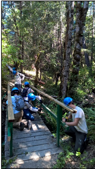
Lower Trinity Youth Conservation Corps Crew, at Ammon Ranch

Once a pioneer homestead, Ammon Ranch Meadow, is a popular site for group camping, live music and disc golf. It is bisected by a creek, and the existing bridges made crossing difficult. In 2019 the forest used recreation fee funds to replace one bridge and repair another, and apply a fresh coat of paint to both. Labor was provided by the local Youth Conservation Corps in partnership with the local disc golf club.