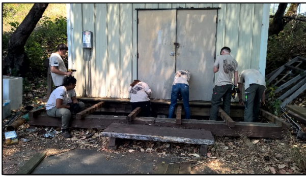
Youth Conservation Corps crew rebuilding the recreation shed deck